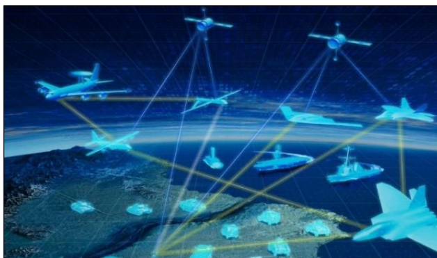
Figure 1. Visualization of JADC2 Vision