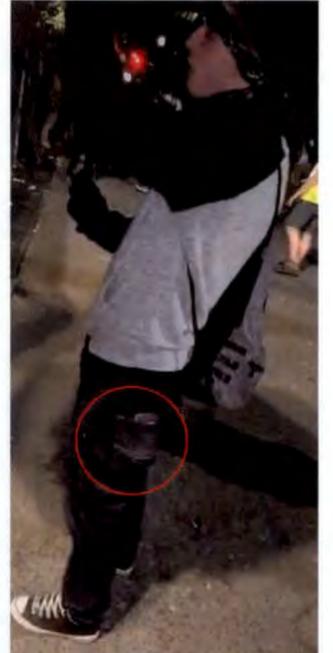
Page 13 - Affidavit of Christopher Tamayo