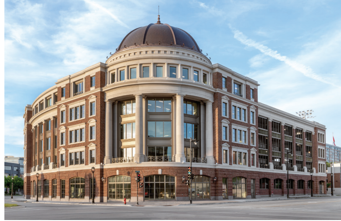
The Lynde and Harry Bradley Foundation 1400 N. Water Street, Suite 300, Milwaukee, WI