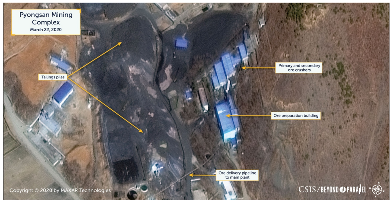
Overview of the Pyongsan Uranium mining complex located northeast of the main plant as of March 22, 2020.