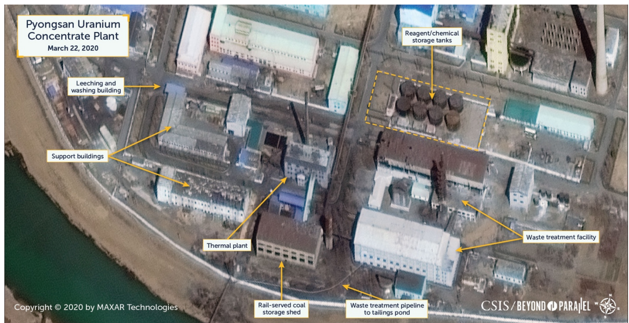
Overview of the southern section of the Pyongsan Uranium Concentrate Plant as of March 22, 2020.