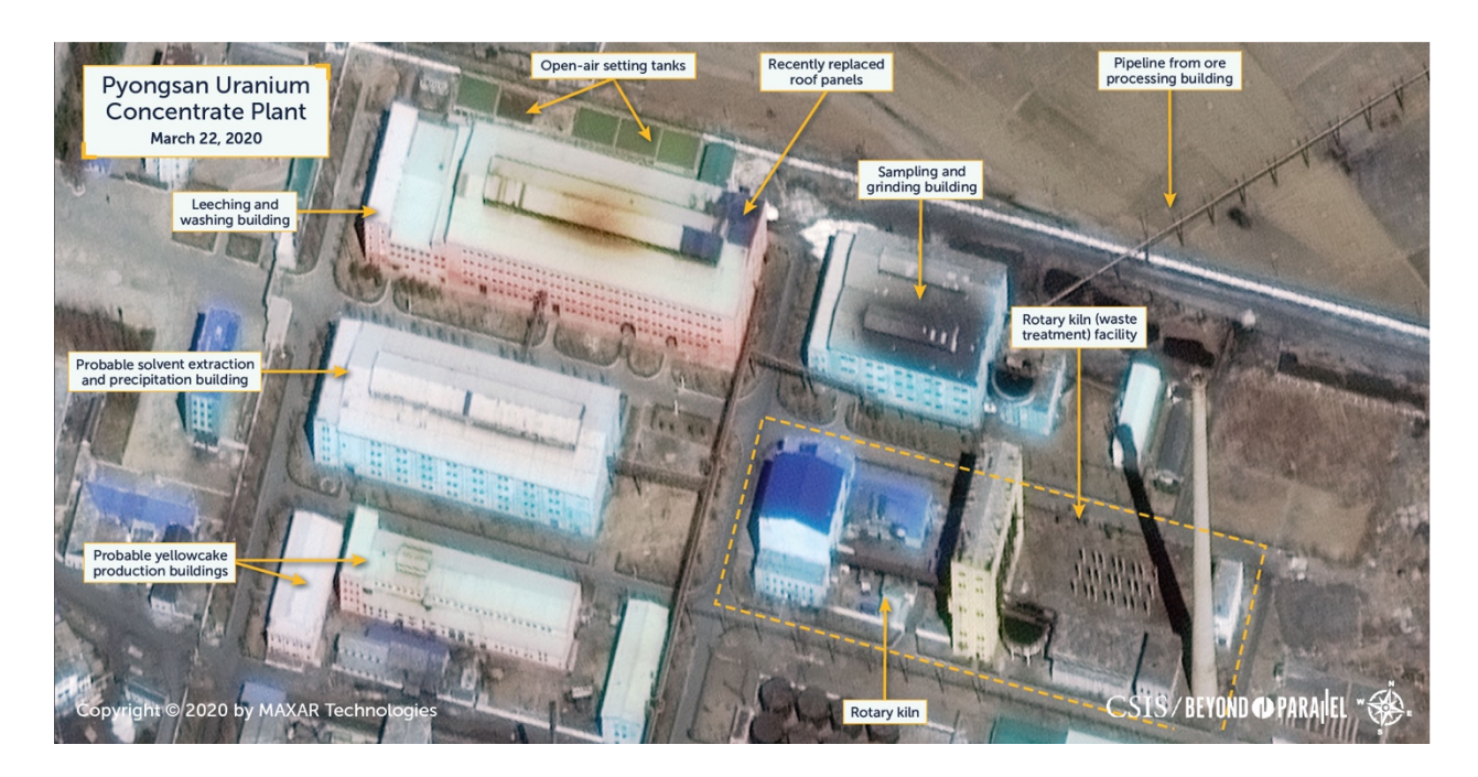
Overview of the northern section of the Pyongsan Uranium Concentrate Plant as of March 22, 2020.