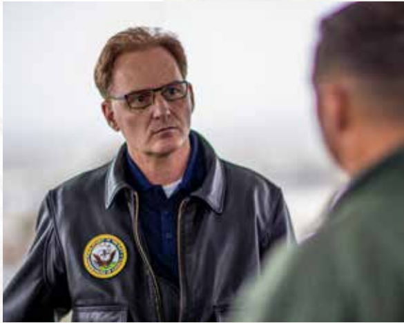
Thomas B. Modly Acting Secretary of the Navy

We live in a dynamic era. For our Navy and Marine Corps team, this dynamism will present challenges—known and unknown, seen and unseen. In fact, perhaps the most predictable thing we can say about the future is that it will be unpredictable. Preparing for that future surely means investing in more platforms and new weapons systems, but nothing will be more important than the investment that we make in learning, and in creating a force made up of people who thirst for it. Accordingly, the landmark 2018 Education for Seapower (E4S) report recognized that the intellectual capability of our Navy and Marine Corps team and a lifelong passion for continuous learning will be our foundation of any credible deterrent to war.