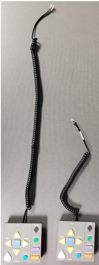
Figure 2 ExpressVote Keypad Cord Extension