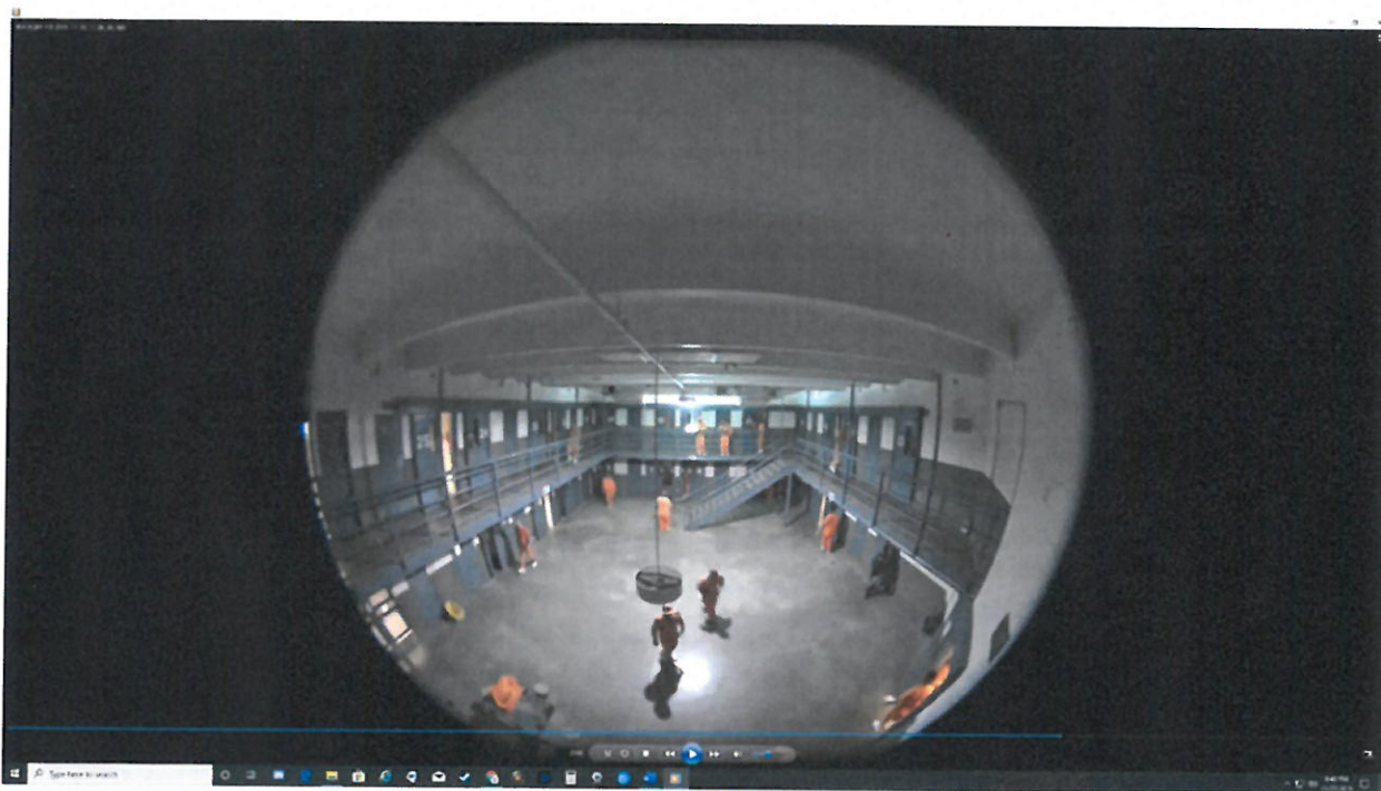
Buckley Unit, November 19 th , 2019 20 minutes into formal count. Inmates are everywhere with their doors opened. Only 1 staff member on the floor with zero control, zero security presence. Inmates have control of their own doors.