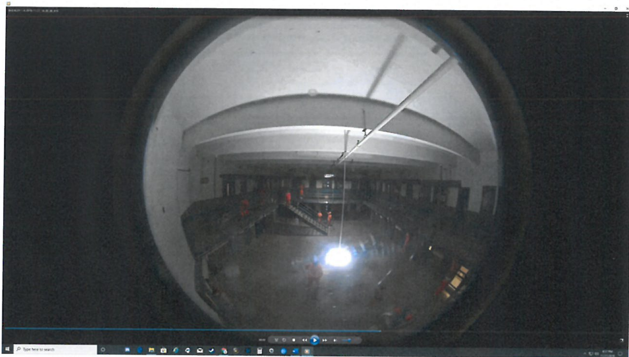
Buckley Unit, November 27 th , 2019. Inmates have control of and are opening their own doors; no staff are present.