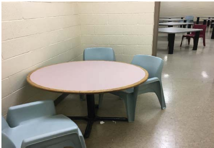
Figure 7. Private visitation meeting rooms and open area room for contact visits exist though the facility does not use them. Observed by OIG at the Aurora facility on November 6, 2018.

Facility management indicated they had security concerns about the passing of weapons, drugs, or other contraband between visitors and detainees. Yet, facility management acknowledged the finding of our spot inspection that contact visits should be considered and implemented in coordination with ICE.