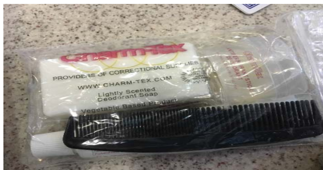
Figure 6. Toiletry bag provided at intake and never replenished. Observed by OIG at the Essex facility on July 24, 2018.

Facilities are required to provide toiletry items, 12 including shampoo, toothbrushes, toothpaste, lotion, and soap. When they enter the facility, detainees at Essex receive a bag with one bar of soap, one stick of deodorant, one toothbrush, a small tube of toothpaste, and a comb, shown in figure 6. Detainees reported never being given lotion or shampoo and never receiving any toiletries after intake. Our review of the facility toiletry stock revealed that the facility had no lotion on hand and the housing units did not have any toiletry supplies to provide to detainees. Facility staff told us the detainees just need to purchase hygiene items through the commissary, which is in direct violation of the ICE standards.