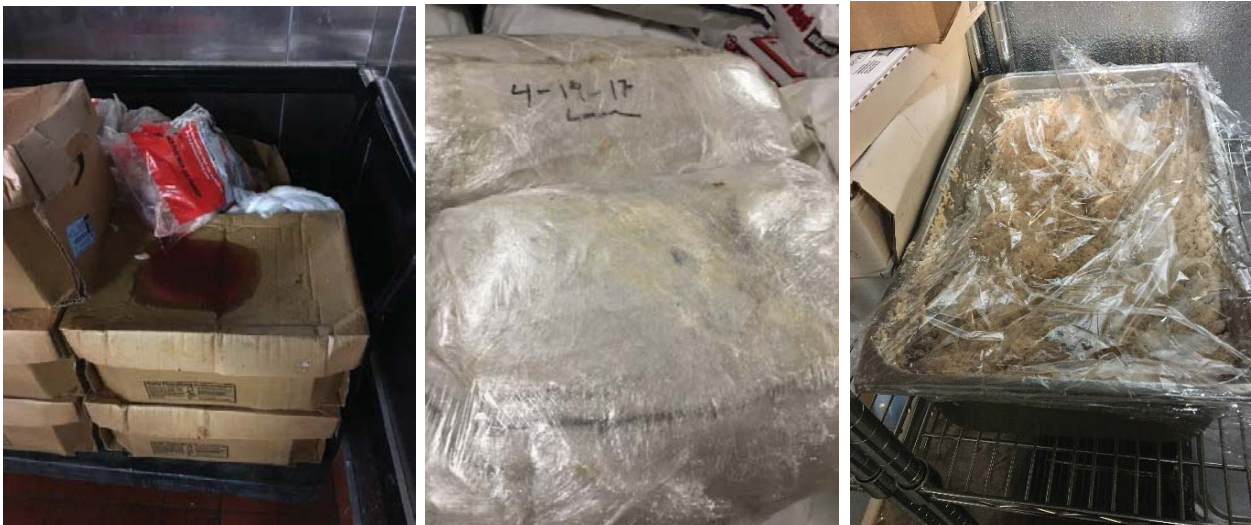
Figure 1. Open packaged raw meat and food items leaking blood, not relabeled and dated, observed by OIG at the Essex facility on July 24, 2018 (left); food not properly labeled or stored at LaSalle facility on August 7, 2018 (center); and unlabeled food with no description or date at Aurora facility on November 6, 2018 (right).