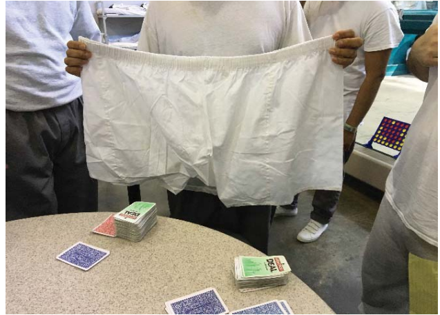
Figure 5. Improperly sized uniform pants and boxer shorts issued to detainees. Observed by OIG at the Essex facility on July 24, 2018.

Facilities are required to provide toiletry items, 12 including shampoo, toothbrushes, toothpaste, lotion, and soap. When they enter the facility, detainees at Essex receive a bag with one bar of soap, one stick of deodorant, one toothbrush, a small tube of toothpaste, and a comb, shown in figure 6. Detainees reported never being given lotion or shampoo and never receiving any toiletries after intake. Our review of the facility toiletry stock revealed that the facility had no lotion on hand and the housing units did not have any toiletry supplies to provide to detainees. Facility staff told us the detainees just need to purchase hygiene items through the commissary, which is in direct violation of the ICE standards.