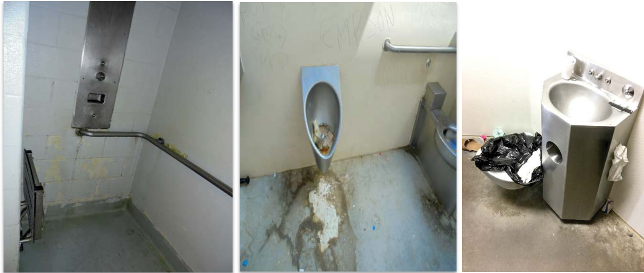
Figure 4. Shower stall with mold, mildew, and peeling paint (left). Outdoor recreation area with stuffed and overflowing toilet (center). Observed by OIG at the Adelanto facility on May 1, 2018. Detainee bathroom with mold and non-working toilet (right). Observed by OIG at the Essex facility on July 24, 2018.