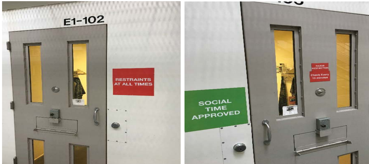
Figure 2. Red placard indicating disciplinary segregation detainees must be moved in restraints at all times, compared to administrative segregation placard indicating social time approved. Observed by OIG at the Aurora facility on November 6, 2018.

disciplinary or administrative segregation, even though they were just being moved from another part of the facility, with no justification documented.