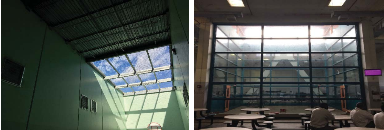
Figure 3. General population outdoor recreation yard shared by two 80-person dorm modules with partially covered roof. Observed by OIG at the Aurora facility on November 6, 2018 (left). Also, as observed by OIG at the Essex facility on July 24, 2018, mesh cages were added to glass enclosures inside housing areas to provide “outdoor” recreation for detainees (right).