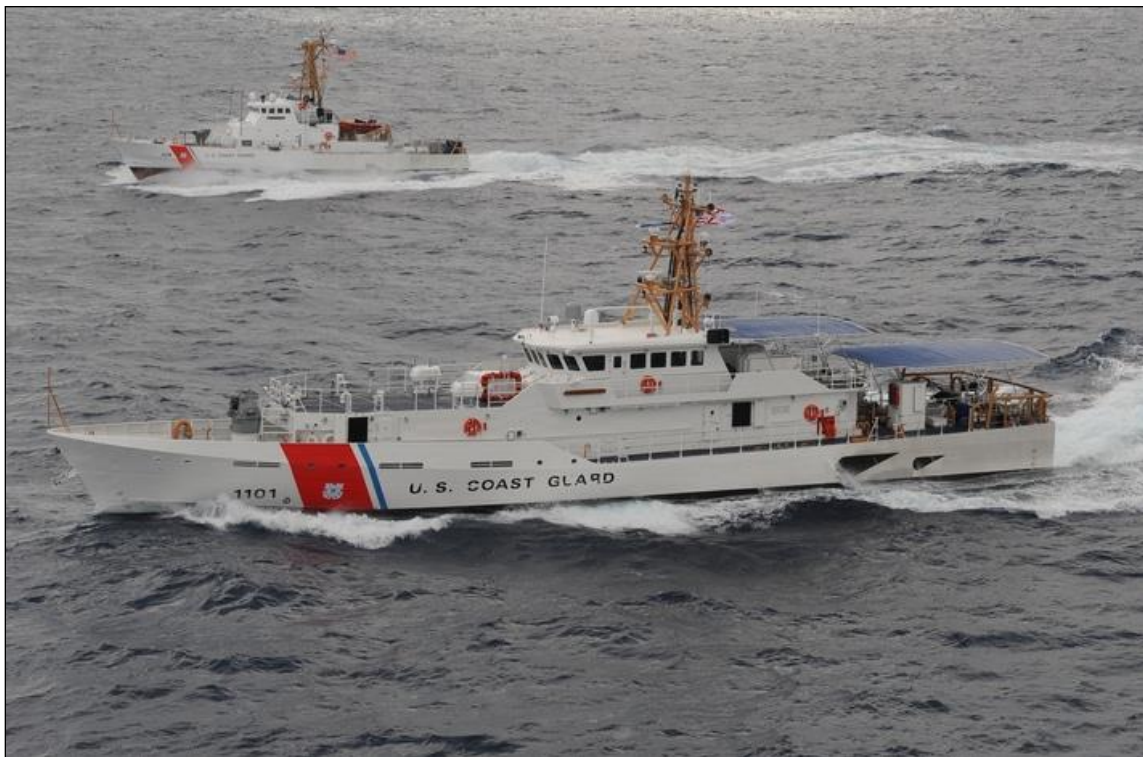
Figure 7. Fast Response Cutter With an older Island-class patrol boat behind