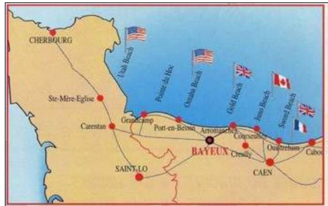
Figure 2. Normandy Beaches on D-Day