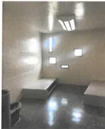
Juvenile Hall 2-person room without mattresses and bedding.

the presence of their peers. For the past five years, all youth in SF’s juvenile hall are on single room status. The following photo shows a double-occupancy room in juvenile hall (vacant room without mattresses and bedding):