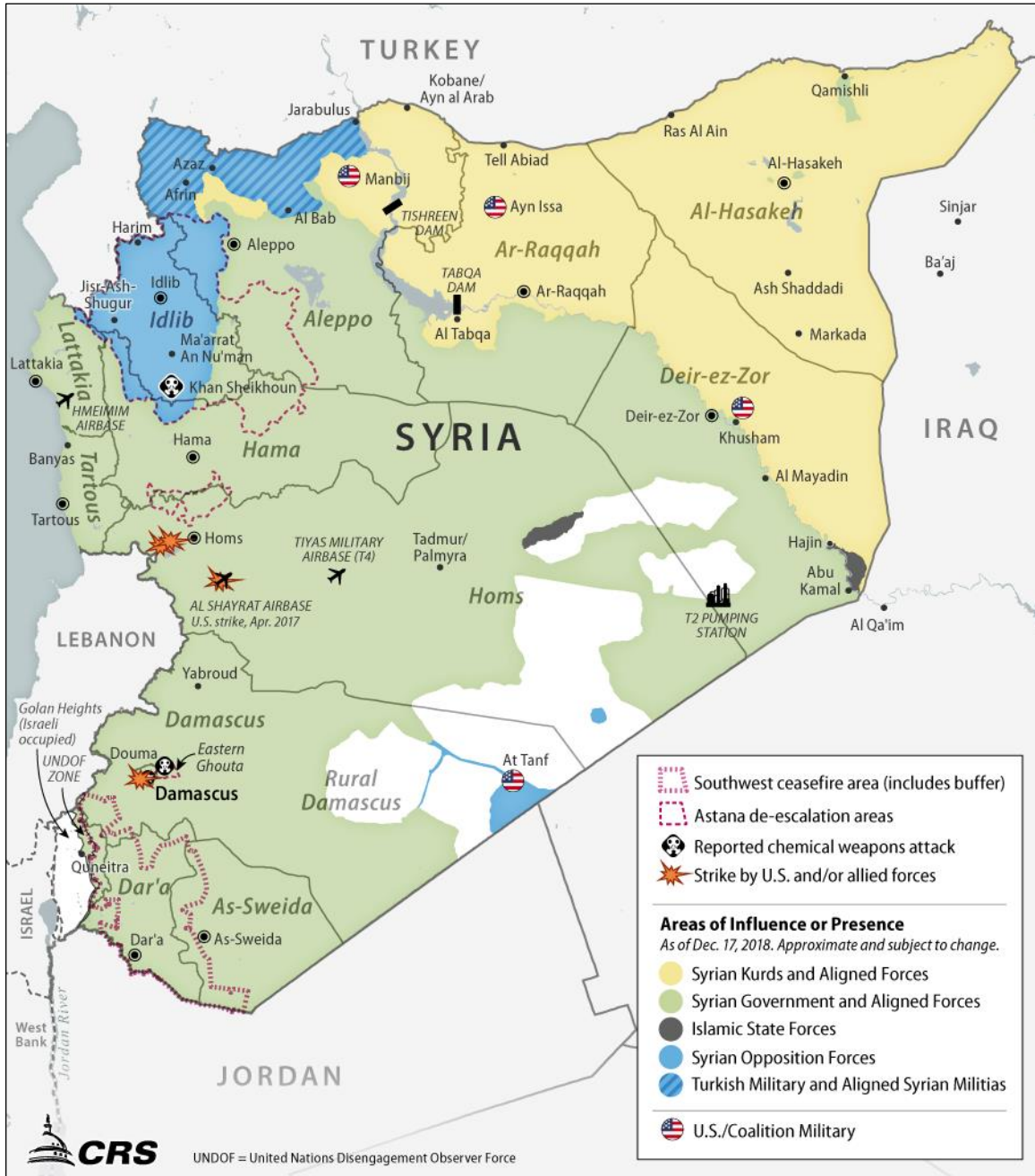
Figure 3. Syria Areas of Influence 2018 As of December 17, 2018

Source: CRS using area of influence data from IHS Conflict Monitor, last revised December 17, 2018. All areas of influence approximate and subject to change. Other sources include U.N. OCHA, Esri, and social media reports.