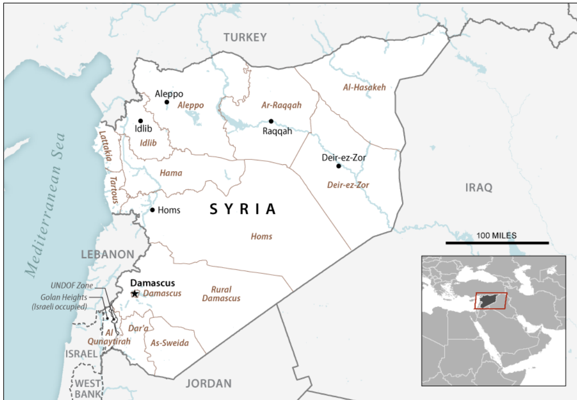
Figure 1. Syria: Map and Country Data

The U.N. has sponsored peace talks in Geneva, but it is unclear when (or whether) the parties might reach a political settlement that could result in a transition away from Asad. With many armed opposition groups weakened, defeated, or geographically isolated, military pressure on the Syrian government to make concessions to the opposition has been reduced. U.S. officials have stated that the United States will not fund reconstruction in Asad-held areas unless a political solution is reached in accordance with U.N. Security Council Resolution 2254. 5