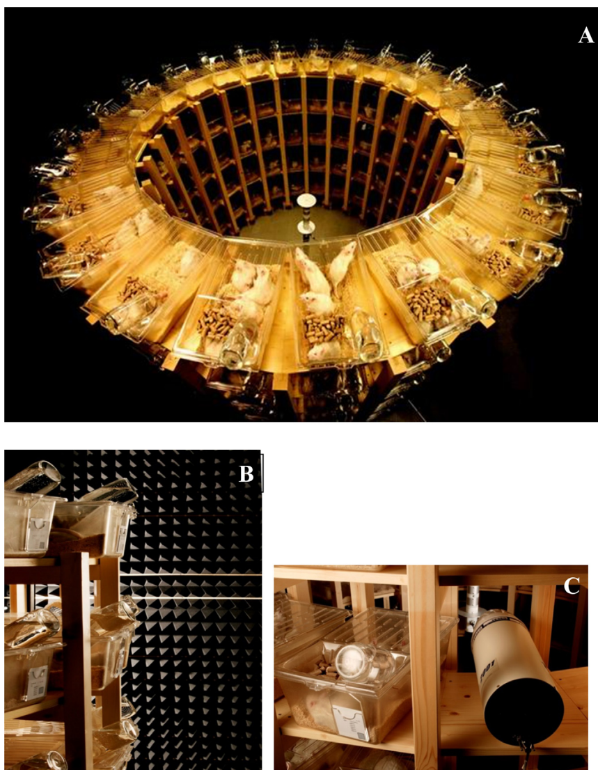
Fig. 1. RI study on 1.8 GHz base station RFR: exposure system. The rat cages were located in wooden circular-shaped devices, as in a sort of condominium. Each single exposure device served at least 400 rats (A). The exposure rooms were totally shielded in order to minimize the effect of field non-uniformity due to reflection and consequent interference caused by the walls (B). Detail of the RFR feedback probe used to measure the field (TESY2001 field sensor) and of the animal cage with methacrylate markers, cover and mangers (C).

produce the following functions: a) generate a GSM signal, with complete channel simulation capability and frequency preselection; b) signal pre – amplifications – age, with gain regulation input; c) final stage, dimensioned for a total power output of plus 50 dBm; d) reference signal loop back input, for closed loops power control; the control was closed at the antenna connection level in order to stabilize at the maximum level the radiation unit RF feed; e) power supply unit; f) cooling unit for continuous use of the device.