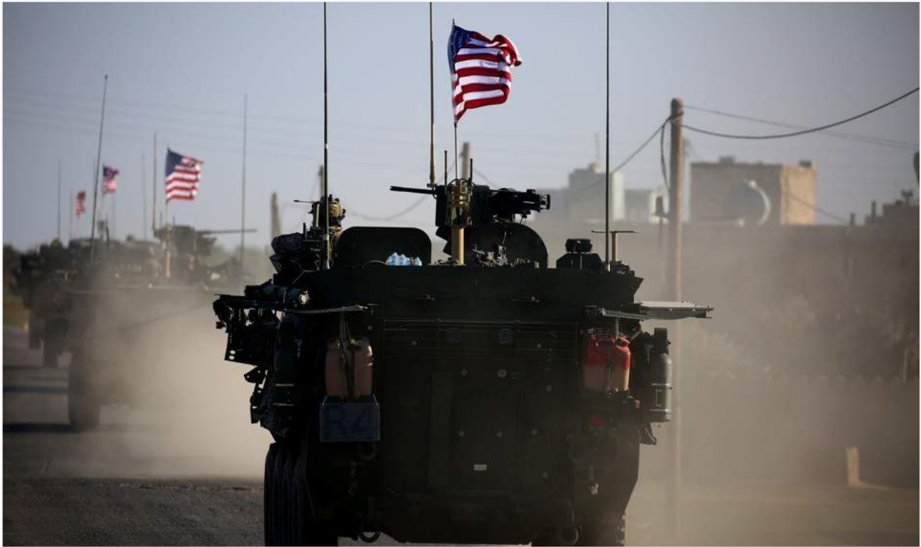
A convoy of US forces armoured vehicles drives near the village of Yalanli, on the western outskirts of the northern Syrian city of Manbij, on March 5, 2017.

The human cost of the war on ISIS has become too easy for Americans to ignore. We in the Obama administration helped shape that war.