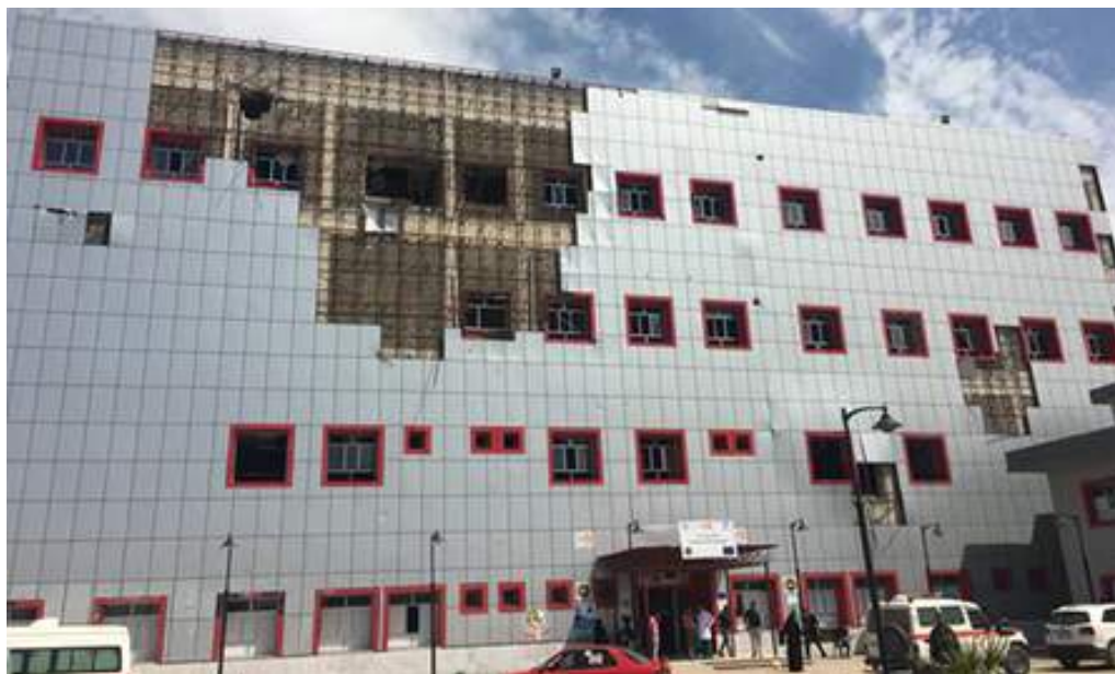
Qayyarah hospital.