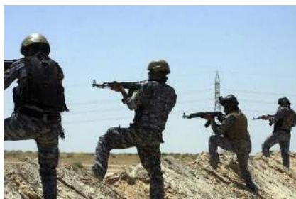
Members of the Iraqi security forces patrol an area near the borders between Karbala Province and Anbar Province on June 16, 2014.

(Baghdad) – Iraqi security forces and militias affiliated with the government appear to have unlawfully executed at least 255 prisoners in six Iraqi cities and villages since