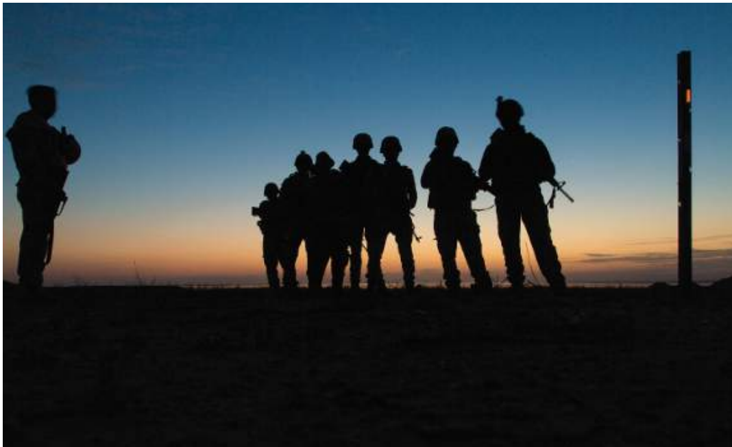
For most Americans, the wars being conducted on our behalf are something that receive little more than an occasional mention on the nightly news or make a fleeting appearance in our social media feeds. That gap becomes even larger when the Department of Defense (DoD) keeps from us accurate information about the real human costs of war (or lacks the information altogether).