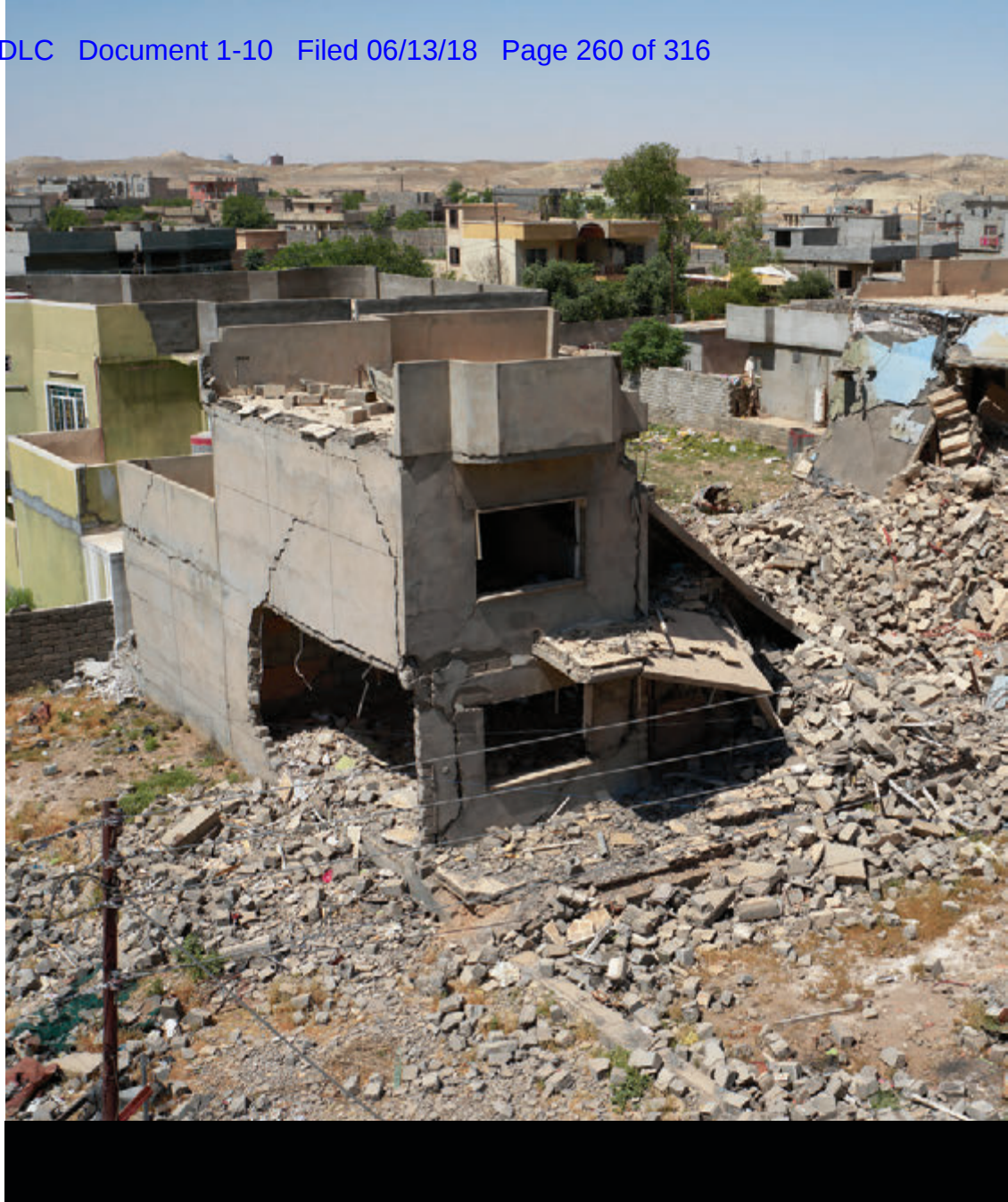
A bombed-out home in Qaiyara.

Finally, we determined who or what had been hit. In addition to interviewing hundreds of witnesses, we dug through the debris for bomb fragments, tracked down videos of airstrikes in the area and studied before-and-after satellite imagery. We also obtained and analyzed more than 100 coordinate sets for suspected ISIS sites passed on by intelligence informants. We then mapped each neighborhood door to door, identifying houses where ISIS members were known to have lived and locating ISIS facilities that could be considered legitimate targets. We scoured the wreckage of each strike for materials suggesting an ISIS presence, like weapons, literature and decomposed remains of fighters. We verified