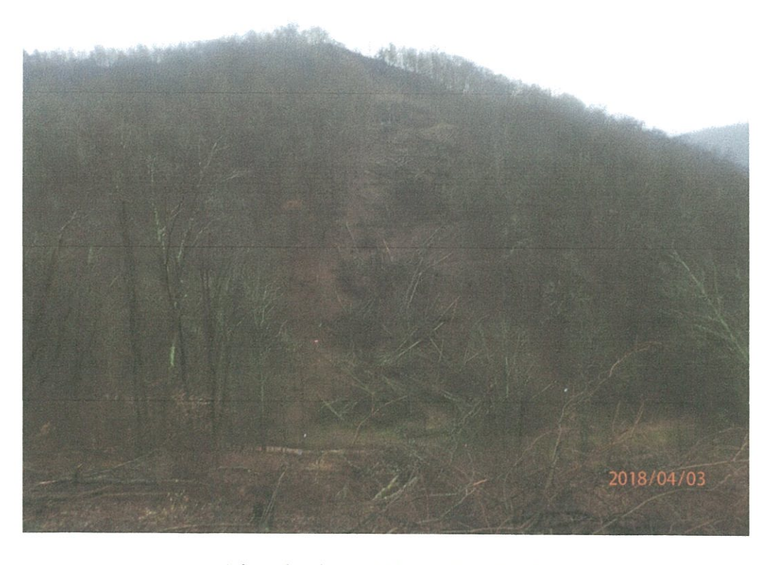
Line clearing off North Fork Road.