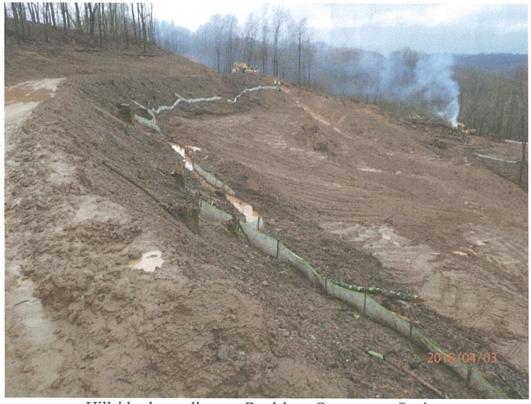
Hillside above slip near Bradshaw Compressor Station.