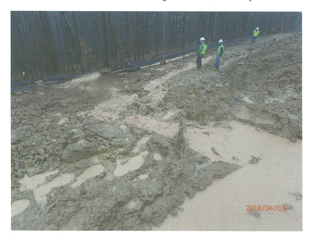
Third site of sediment laden water leaving site at Bradshaw Compressor Station.