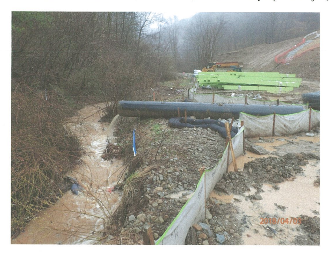
UT of Mobley Run near Mobley Compressor Station.