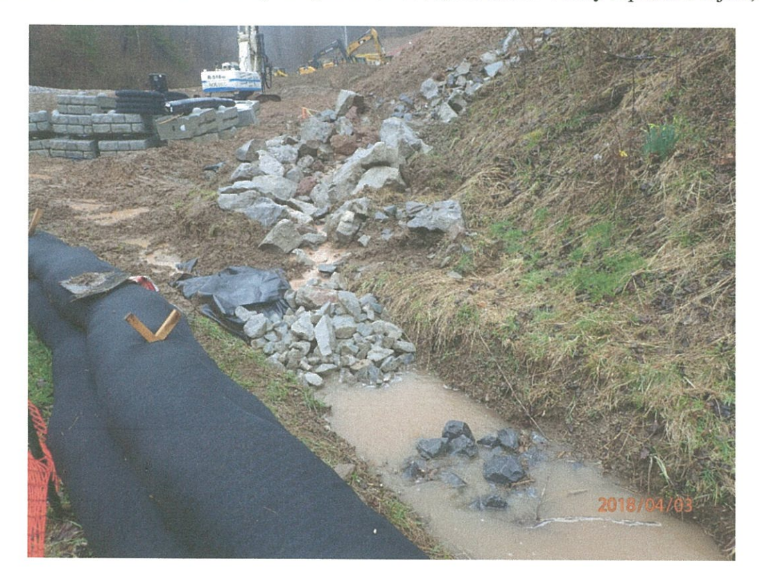
Sediment laden water leaving site through drop inlet.