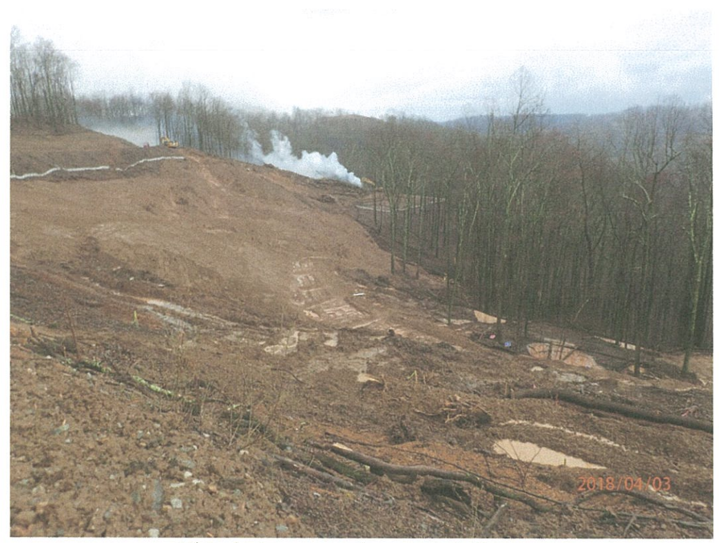
Disturbed area near the reported slip area.