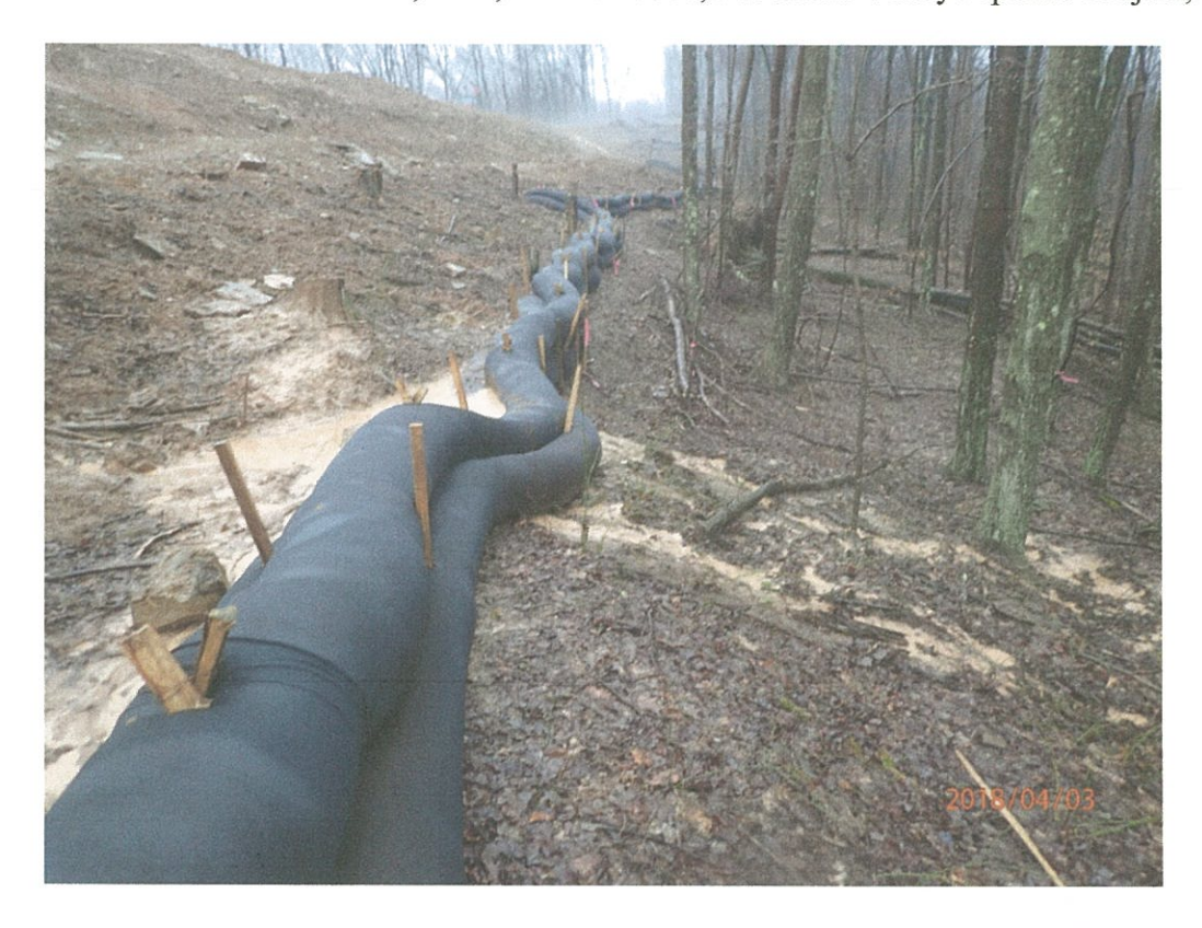
Second site of sediment laden water leaving site at Bradshaw Compressor Station.