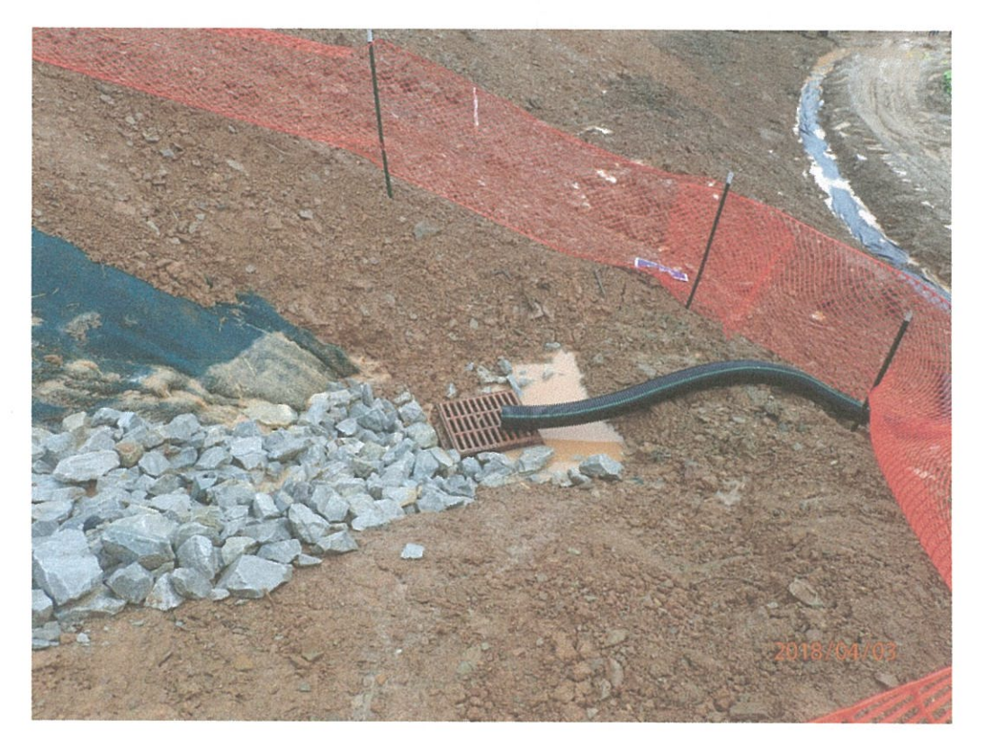
Unprotected drop inlet at Mobley Compressor Station.