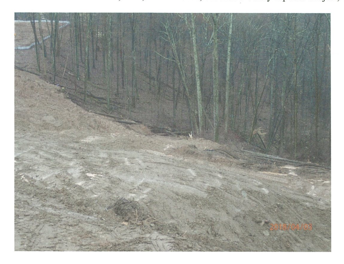
Slope above slip area.