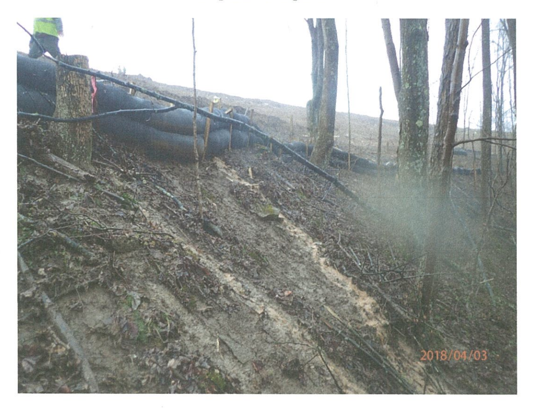
Sediment laden water leaving site at Bradshaw Compressor Station.