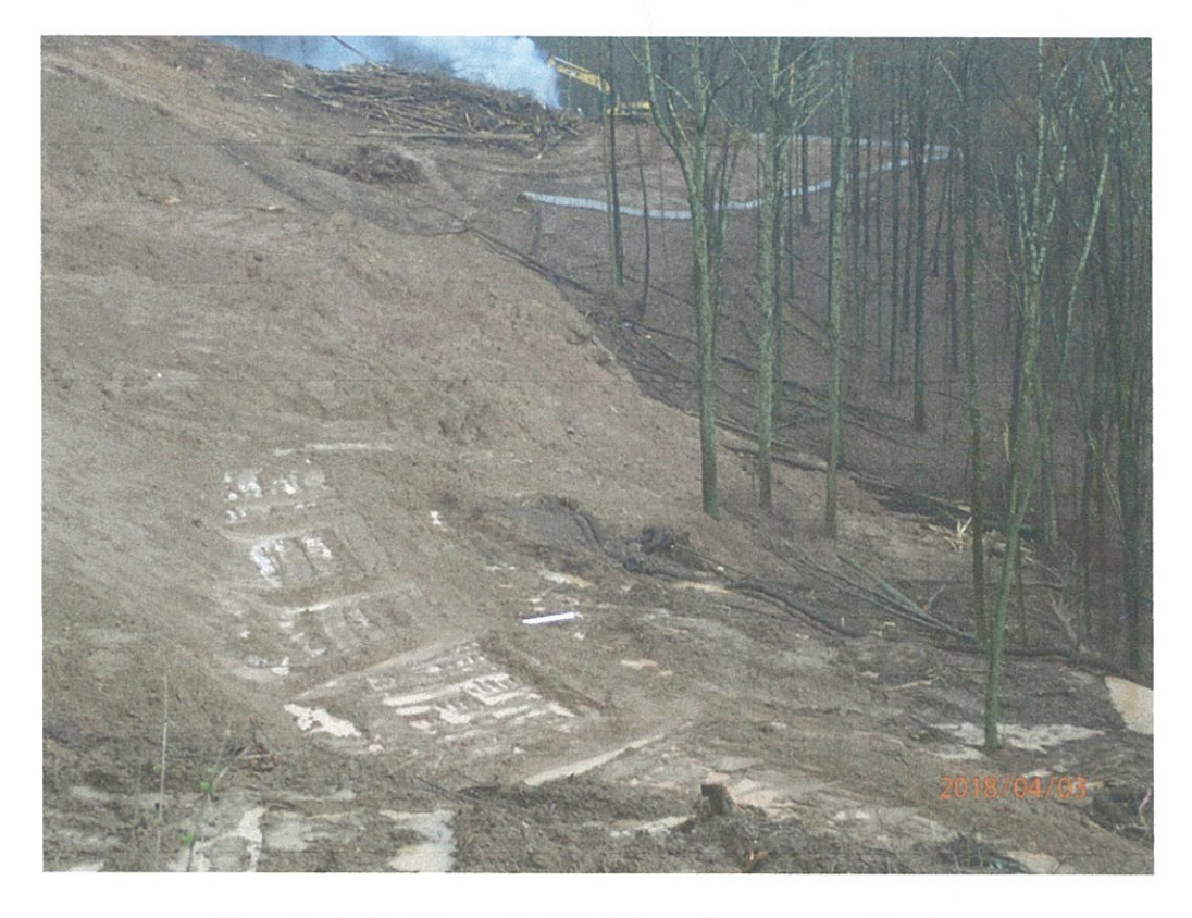
Reported slip area near Bradshaw Compressor Station.