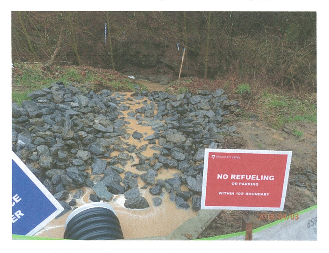
Sediment laden water leaving site into UT of Mobley Run.