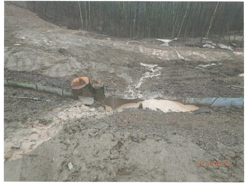
Concentrated flow eroding slope near slip.