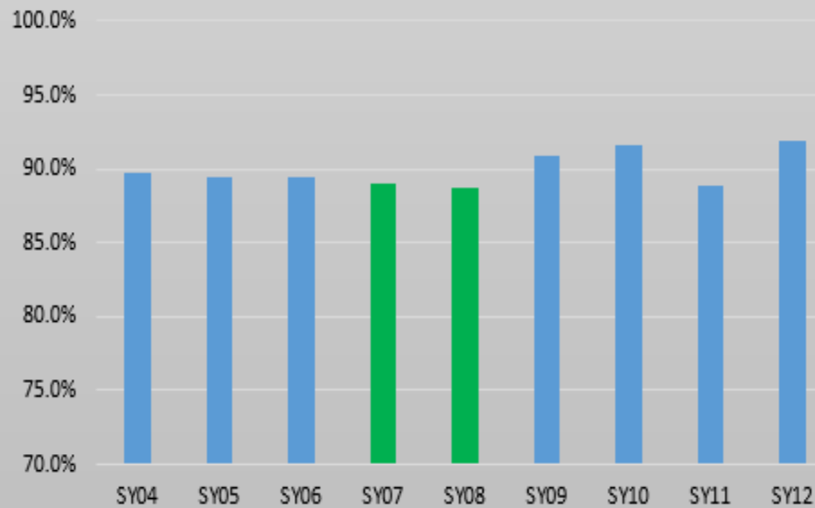
KCPS ADA - Wednesday