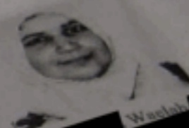
Waelah Female: Wife [REDACTED]