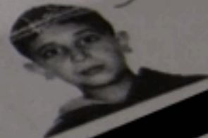
Male: Son [REDACTED]