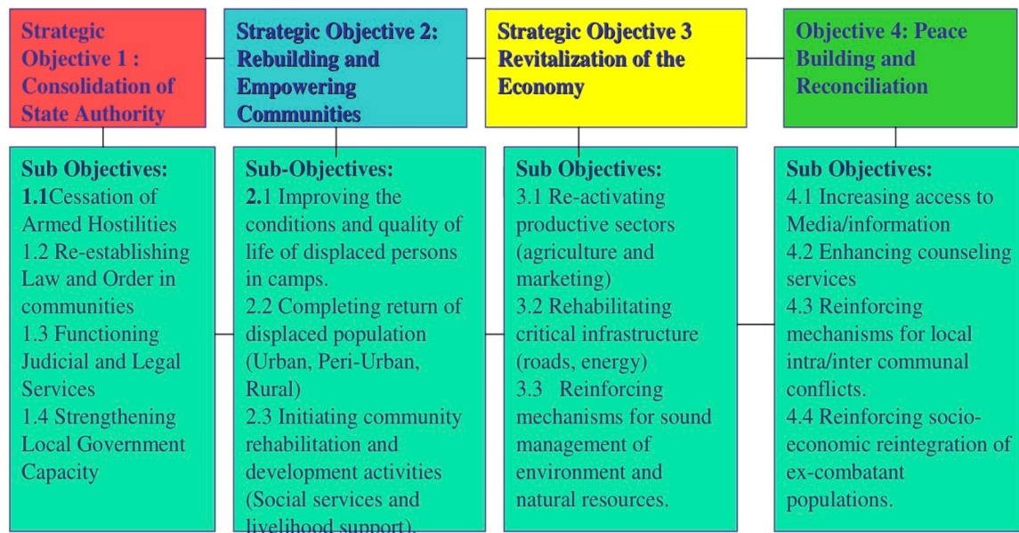
Diagram 2: PRDP Strategic Objectives and Goals