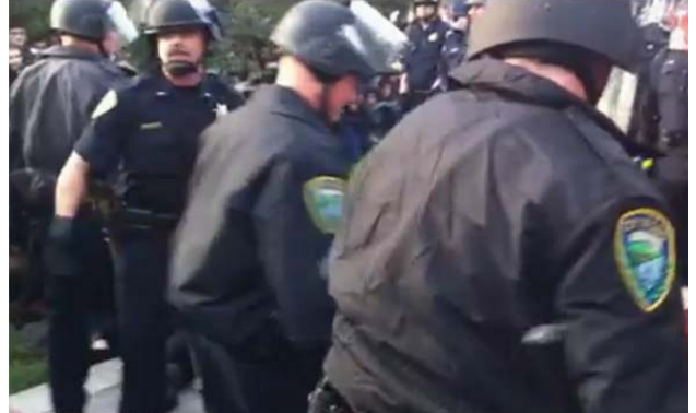
Officer P begins to walk away from the seated activists.<sup>529</sup>