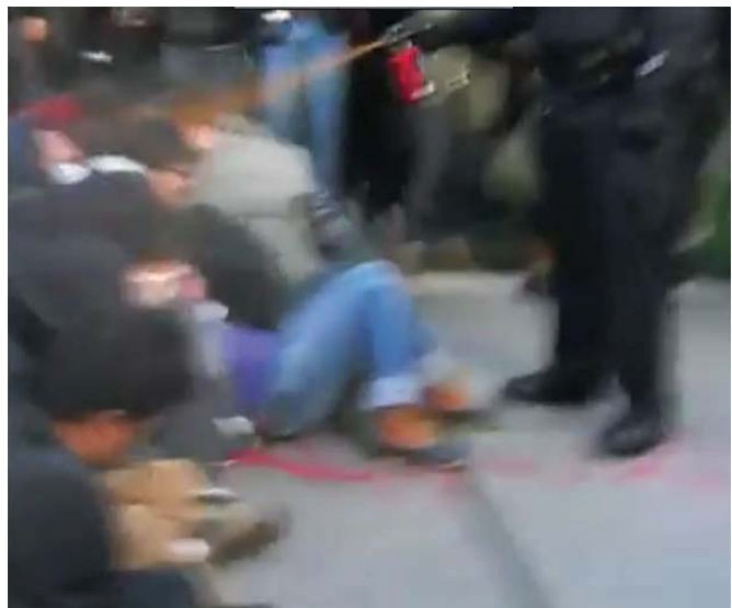
Video footage suggests that Lieutenant Pike deployed the MK-9 at less than the minimum recommended distance of six feet from his targets.<sup>396</sup>

According to Product Specifications issued by Defense Technology, the manufacturer of the MK-9, the minimum recommended distance is six feet.<sup>395</sup>