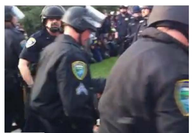
Officer P releases the arm of the seated activist and turns away after Pike lifts the pepper spray.

526 http://www.youtube.com/watch?v=K8Uj1cV97XQ at 6:19. [Exhibit 136] 527 http://www.youtube.com/watch?v=K8Uj1cV97XQ at 6:19. [Exhibit 136]