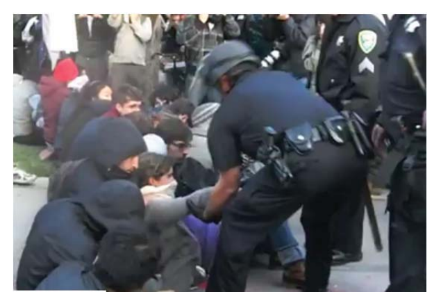
Officer P pulls the arm of a seated activist with DPD officers on either side of him.<sup>525</sup>

Video footage shows Officer P leading several DPD officers up the walkway to the seated activists, with Lieutenant Pike facing him on the other side of the seated activists.<sup>524</sup> Officer P leans forward to pull a female activist with his hands, is motioned away by Pike, and then turns to walk away with his arms raised at the elbow. The following video stills illustrate this sequence of events: