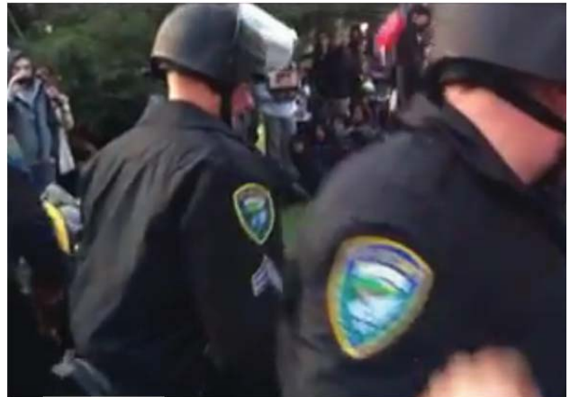
As Officer P continues to bend forward to pull the seated activist, Pike lifts the pepper spray canister, visible as a red shape between the officers' helmets in the above picture.<sup>527</sup>