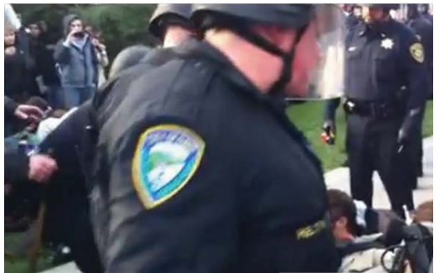
Shown from a different angle, Officer P helmet and back are visible, behind two DPD officers, as he pulls the arm of the seated activist. Pike faces him from within the circle, holding a canister of MK-9 pepper spray.<sup>526</sup>