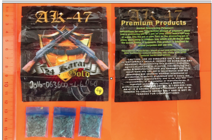
Figure 3. AK-47 24 Karat Gold Foil Wrapper Containing Herbal Products Recovered from a Patient Involved in the Outbreak.

LC–QTOF/MS denotes liquid chromatography–quadrupole time-of-flight mass spectrometry, NYC New York City, and UCSF University of California, San Francisco.