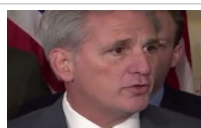
Kevin McCarthy Drops Out Of House Speaker Race: My Comment About Benghazi "Wasn't Helpful"