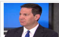
Mark Halperin: After Speaking With Regular People, I Now Understand Ben Carson's Appeal