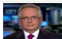
Ralph Peters: "It's Over, It's Done," Too Late For A No-Fly Zone In Syria