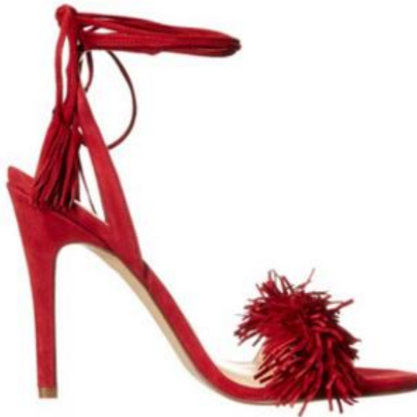
Trump Hettie Shoe

4. Upon information and belief, Defendants Ivanka Trump and her company IT partnered with Marc Fisher in or around 2010 to launch her eponymous footwear brand. Seeking the same success Aquazzura experienced but without having to put in the hard creative work, Defendants resorted to knocking off Plaintiff's popular designs. Defendants' virtually identical copy of the sought-after Wild Thing Shoe, marketed as the Hettie (the "Infringing Shoe"), is shown below: