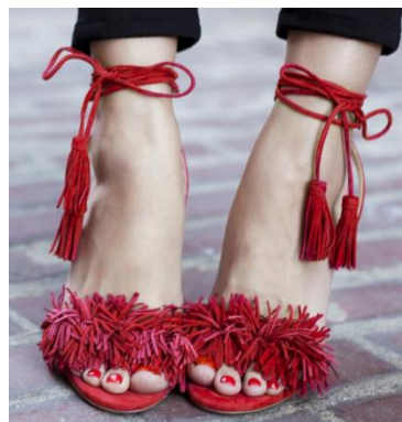
Trump Hettie Sandal

36. Upon information and belief, Defendants have imported, advertised, offered for sale, and sold the Infringing Shoe in the United States, including in New York State and this judicial district.