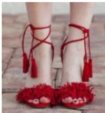
Aquazzura Wild Thing Sandal

35. The below images illustrate that on wearers’ feet, the Wild Thing Shoe and Defendants’ Infringing Shoe are virtually indistinguishable: