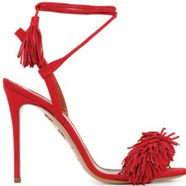
Aquazzura Wild Thing Shoe

2. One of Plaintiff’s best-known and best-selling models is the Wild Thing, which is shown below: