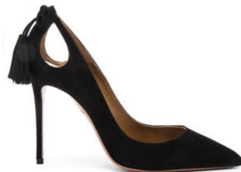
Aquazzura Forever Marilyn Shoe