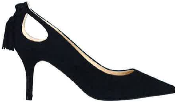
Trump “Teagin Pointy Toe Pump with Tassel”