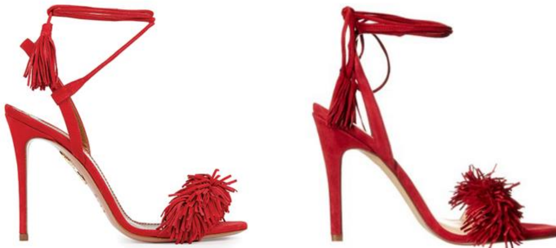
Aquazzura Wild Thing Shoe

31. A visual comparison of Defendants’ Infringing Shoe shows that it is virtually an exact copy of Aquazzura’s Wild Thing, as shown below: