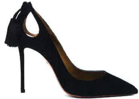
Aquazzura “Forever Marilyn” Shoe

Similarly, the “Teagin Pointy Toe Pump with Tassel” mimics the distinctive features of the “Forever Marilyn” shoe, namely, the symmetrical teardrop shaped cutouts on either side of the heel and the decorative tassel suspended from the top of the heel.