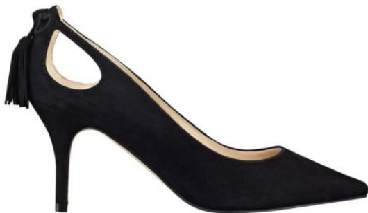
Trump Teagin Pointy Toe Pump with Tassel

Aquazzura complained to Defendants about their copies of Aquazzura's well-known Belgravia and Forever Marilyn shoes as well, which are shown below: