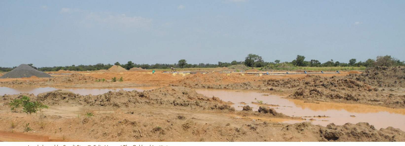
Land cleared by Saudi Star

Combined with other repressive laws, such as the Charities and Societies Proclamation (No. 621/2009), which severely limits the abilities of local and international human rights groups,<sup>84</sup> the Government of Ethiopia has created a culture of fear and repression, in which ordinary people who speak up against government policies and programs are arrested and confined under horrific and abusive conditions.