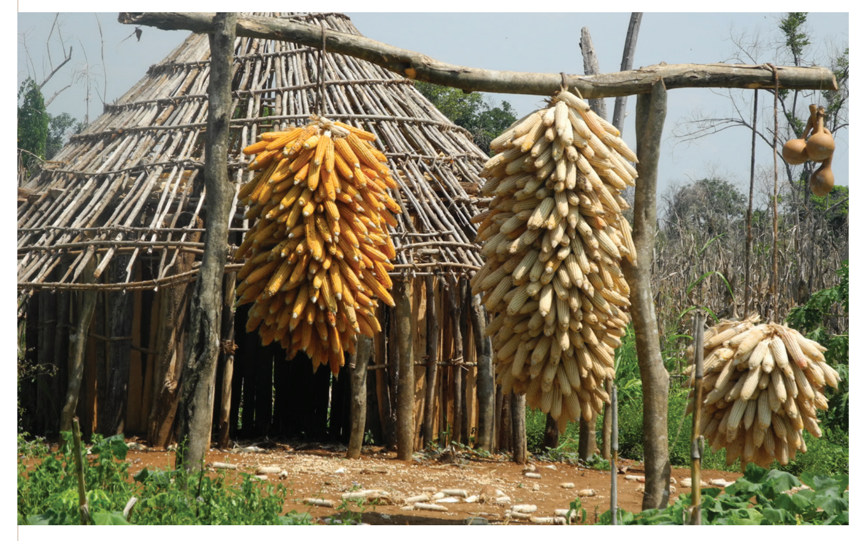
Maize harvest in Gambella

Despite these changes - and the Inspection Panel's conclusion that PBS III should have, but failed to, comply with the Indigenous Peoples Policy<sup>125</sup> – this important safeguard was not applied to the ESPES program.<sup>126</sup> Instead, the Bank conducted an Environmental and Social Systems