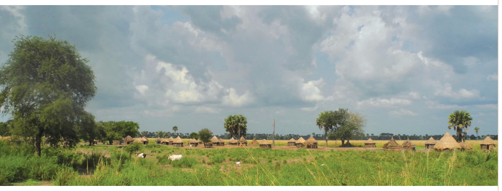
Village in Karuturi lease area

relation to the PBS program, one of the translators for the World Bank Inspection Panel investigation was arrested one week after the report's release and charged under the Anti-Terrorism Proclamation (see Box 3). Numerous others from the Gambella region have been arrested, killed, or have fled the country because of the actions of the Government.<sup>91</sup> Given the above, it seems highly irresponsible to rely on government agencies for the monitoring of this project.