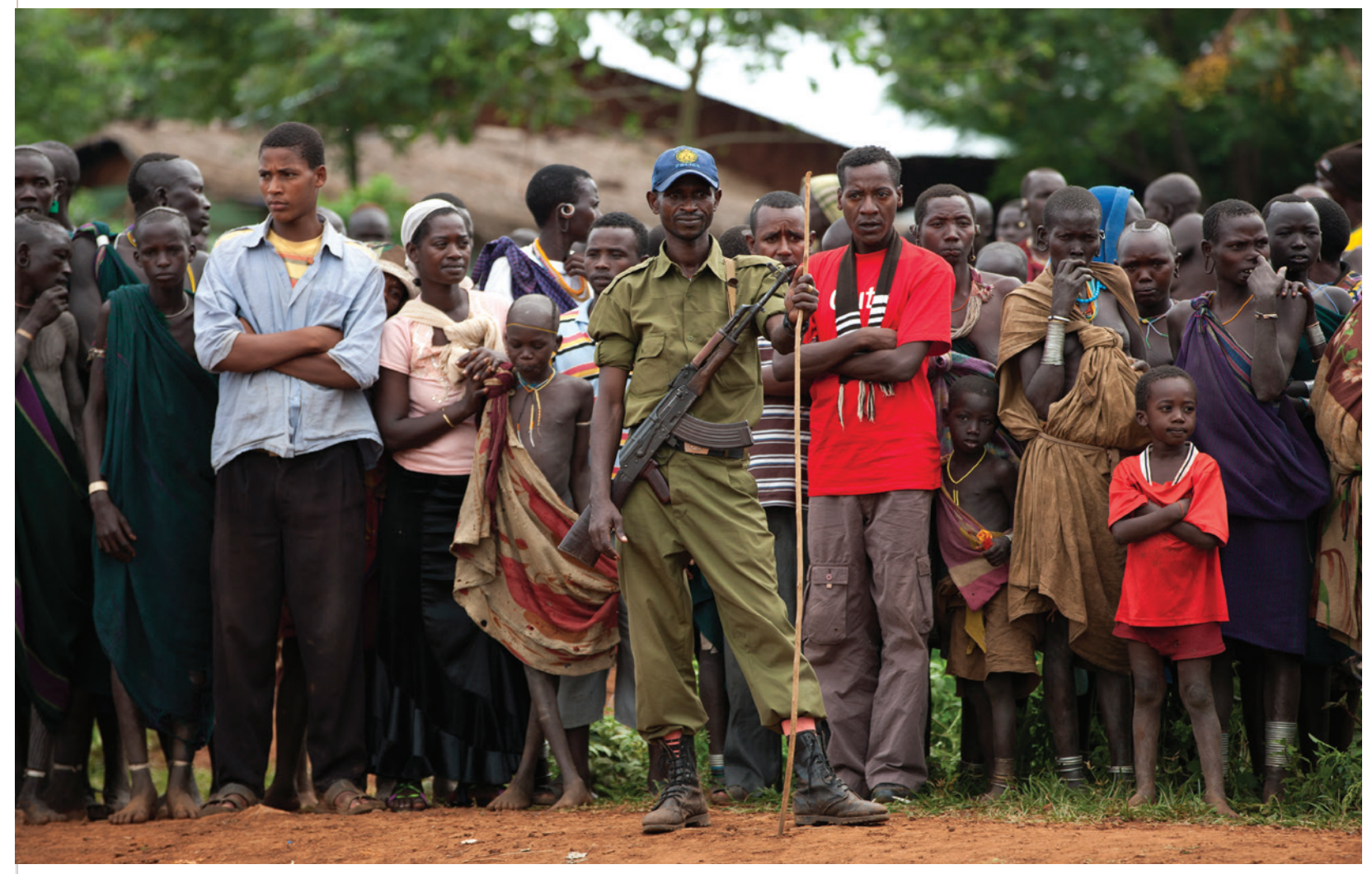
Kibbish, Omo Vallley

The new World Bank financing for Ethiopia through ESPES is nothing more than a renaming of PBS, which continues to ignore the grave concerns associated with the program and human rights abuses in the country. In addition, by voting in favor of this program, the US Treasury is in violation of the requirements set out by the US Congress. Despite solid evidence of forced displacements and widespread human rights abuses, the US Treasury and the World Bank have chosen a business-as-usual approach in Ethiopia, while once again failing truly vulnerable communities in the country.