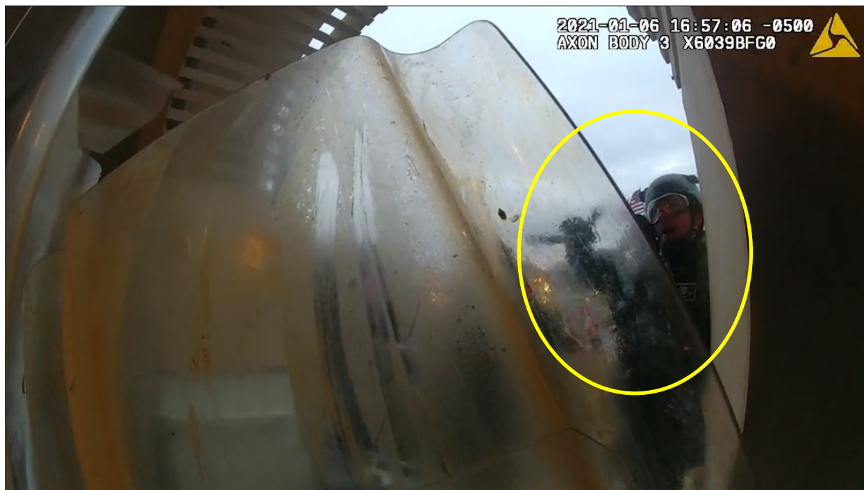
Exhibit 4 (BWC) at 0:37 seconds – Richmond yelling at officers