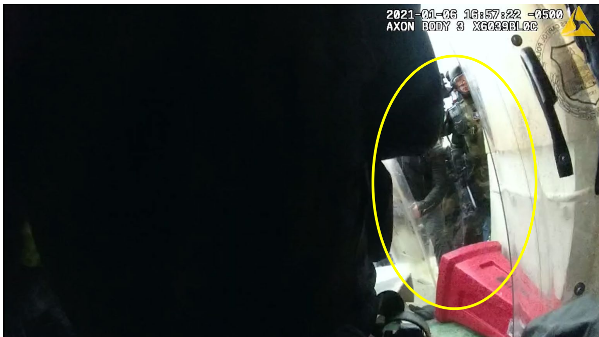
Exhibit 5 (BWC) at 0:47 seconds