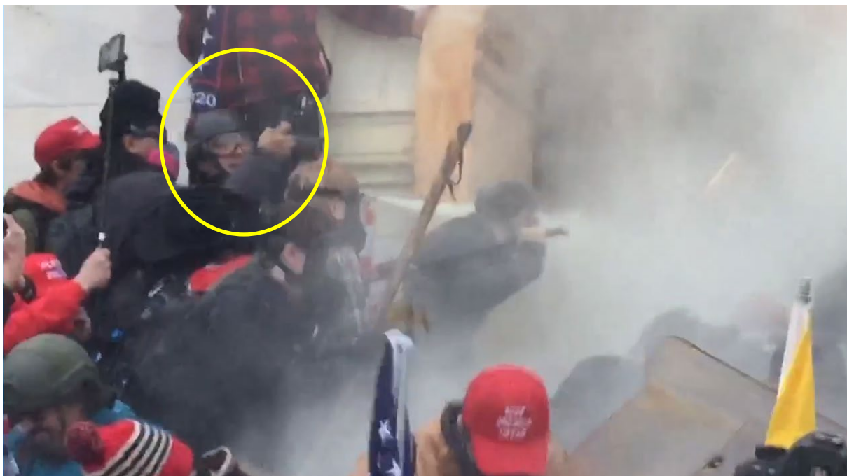
Screenshot of Exhibit 2 (open source video) at 1:48