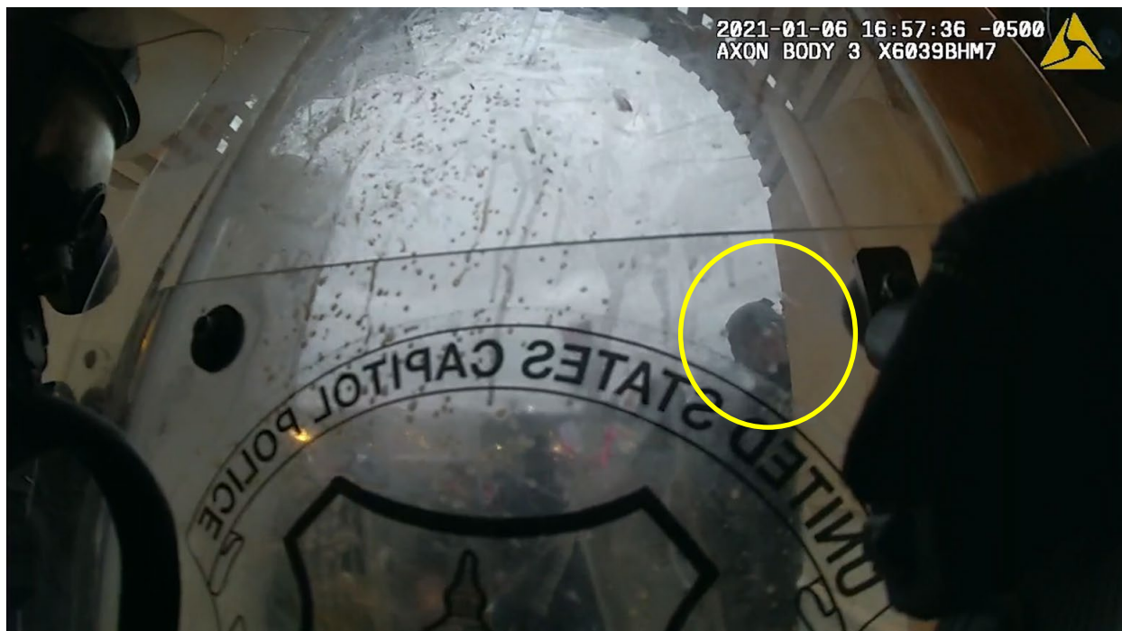
Exhibit 3 (BWC) at 1:02