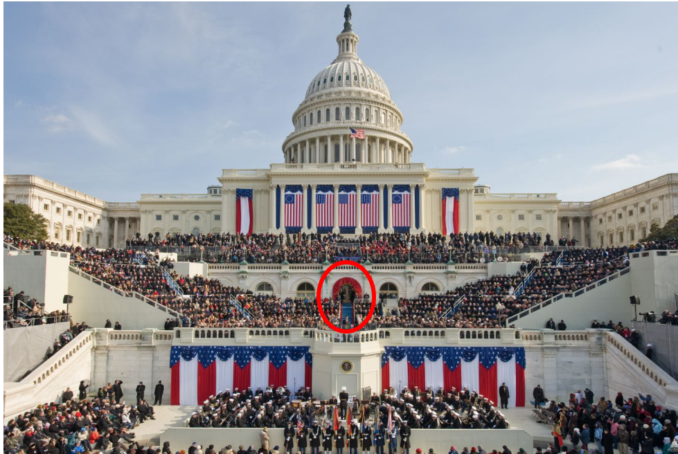
Image 1 2 - The Tunnel on the Lower West Terrace

On January 6, 2021, when rioters arrived at the doors behind this Archway, the outer set of doors was closed and locked, and members of Congress who had fled from the rioters were sheltering nearby. Members of the United States Capitol Police (“USCP”), assisted by officers from the District of Columbia Metropolitan Police Department (“MPD”), were arrayed inside the doorway and guarding the entrance. Many of these officers had already physically engaged with the mob for over an hour, having reestablished a defense line here after retreating from an earlier protracted skirmish on the West Plaza of the Capitol building just below.