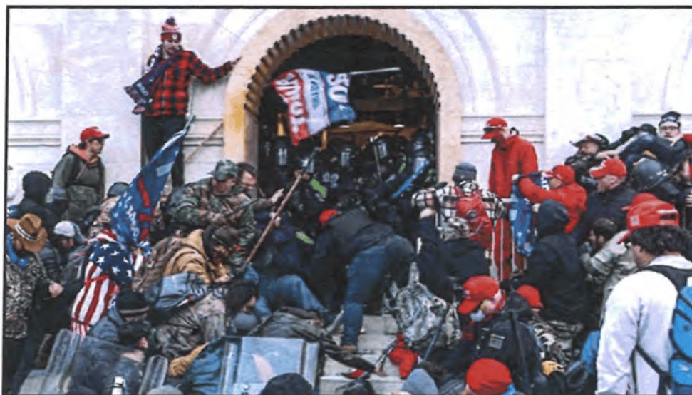
Photograph of the Capitol on January 6, 2021 115