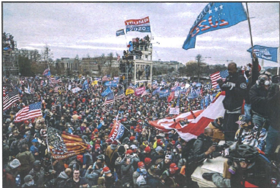
Photograph of the Capitol on January 6, 2021 113