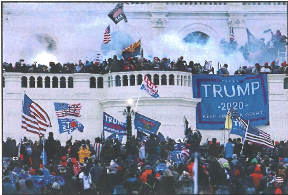
Photograph of the Capitol on January 6, 2021 112