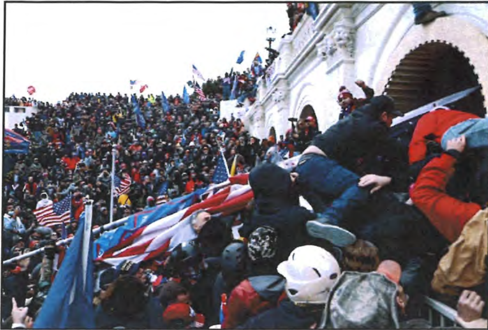
Photograph of the Capitol on January 6, 2021 114