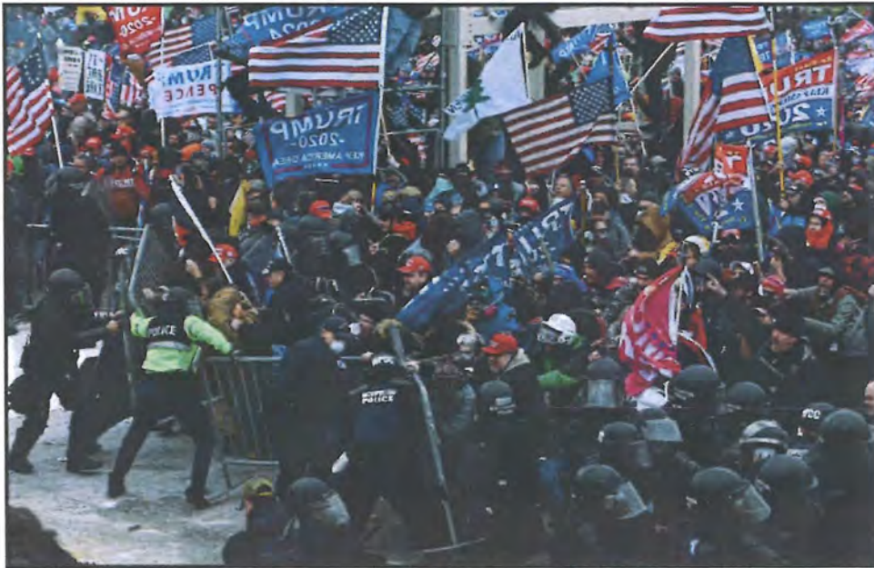
Photograph of the Capitol on January 6, 2021 117