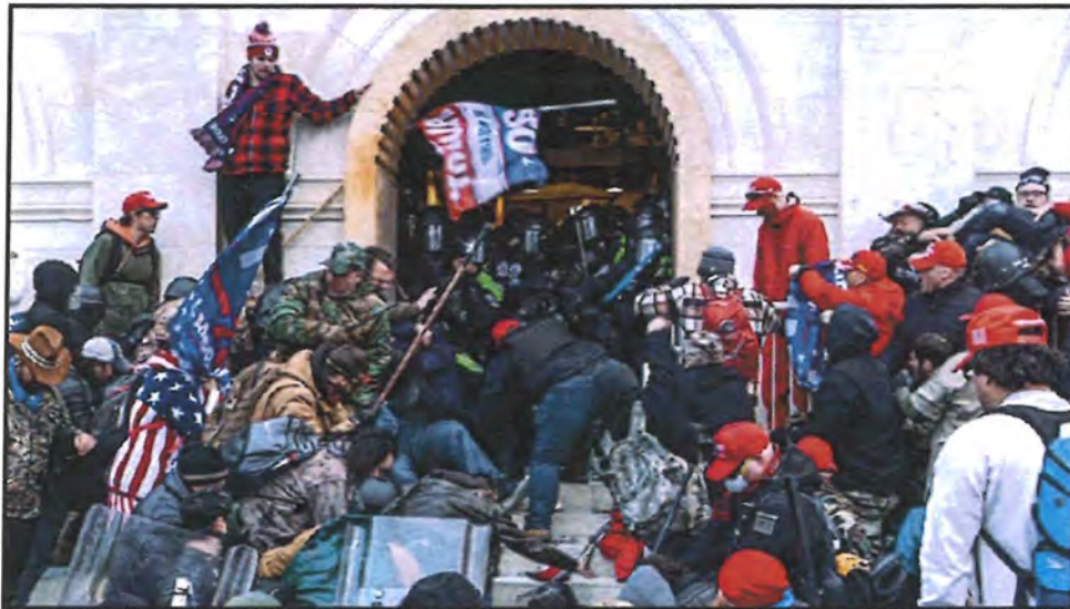
Photograph of the Capitol on January 6, 2021 115