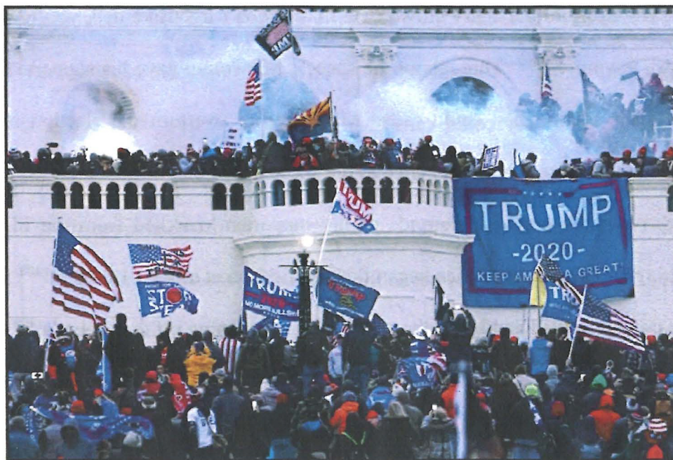
Photograph of the Capitol on January 6, 2021 112