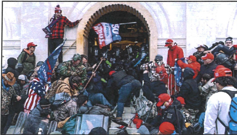
Photograph of the Capitol on January 6, 2021 115