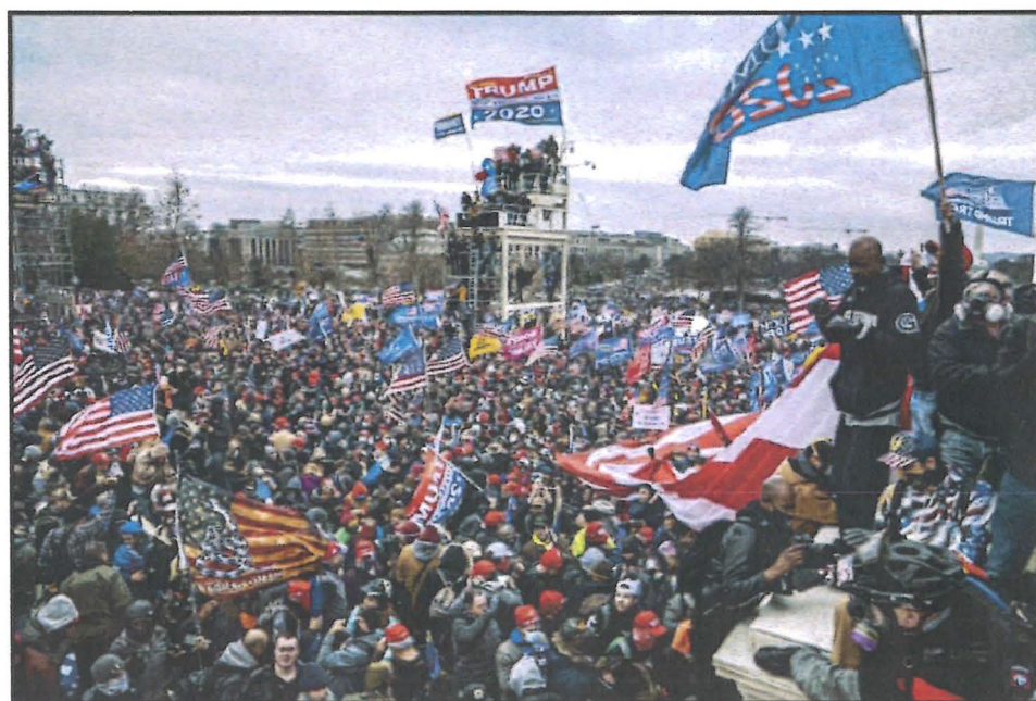
Photograph of the Capitol on January 6, 2021 113