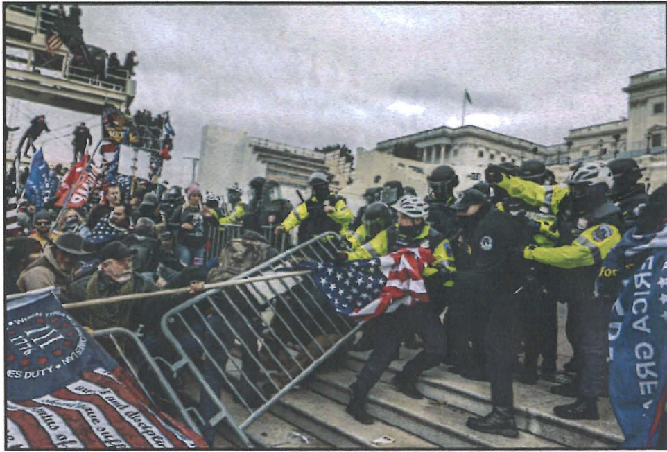
Photograph of the Capitol on January 6, 2021 116