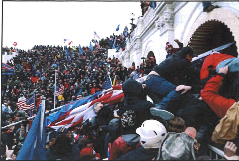
Photograph of the Capitol on January 6, 2021 114