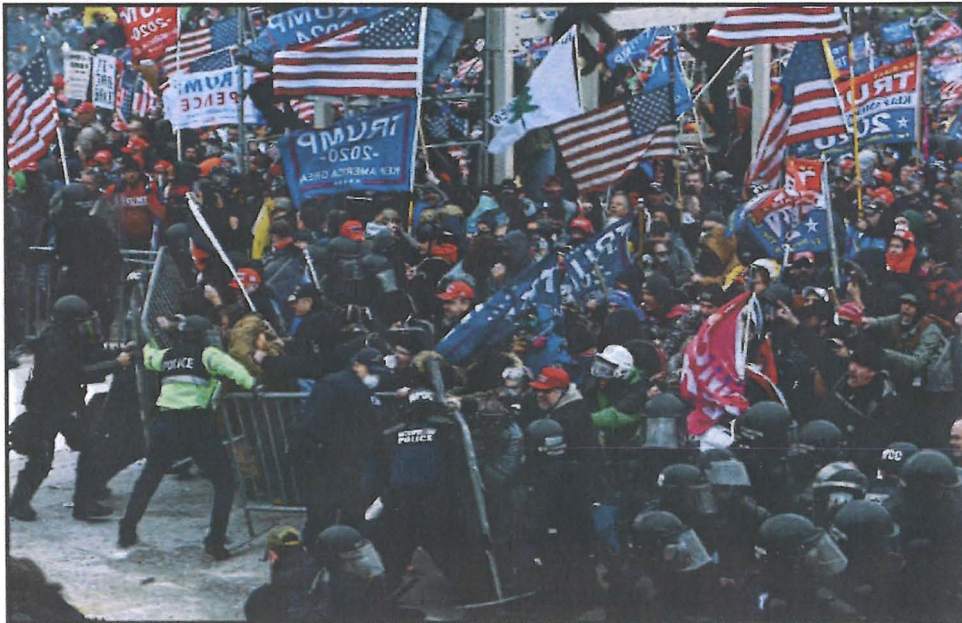
Photograph of the Capitol on January 6, 2021 117