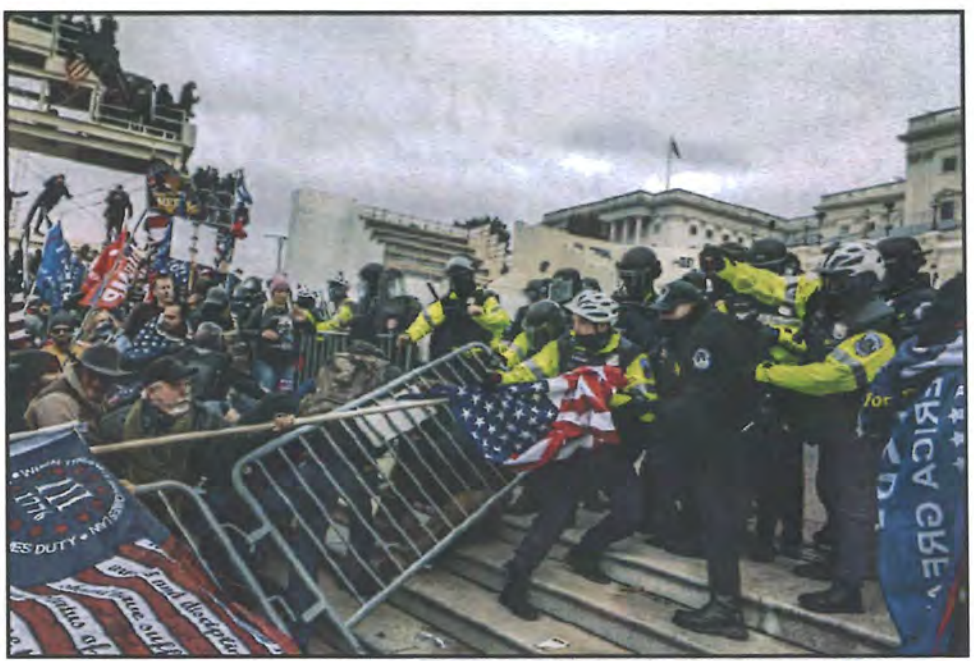
Photograph of the Capitol on January 6, 2021116