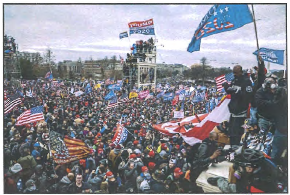
Photograph of the Capitol on January 6, 2021<sup>113</sup>