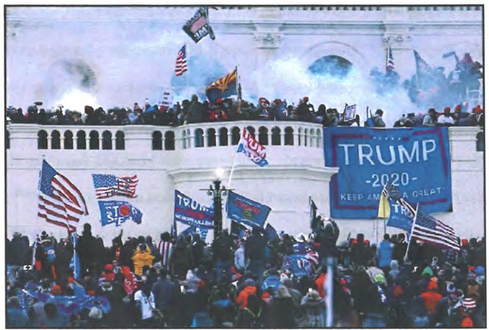
Photograph of the Capitol on January 6, 2021<sup>112</sup>