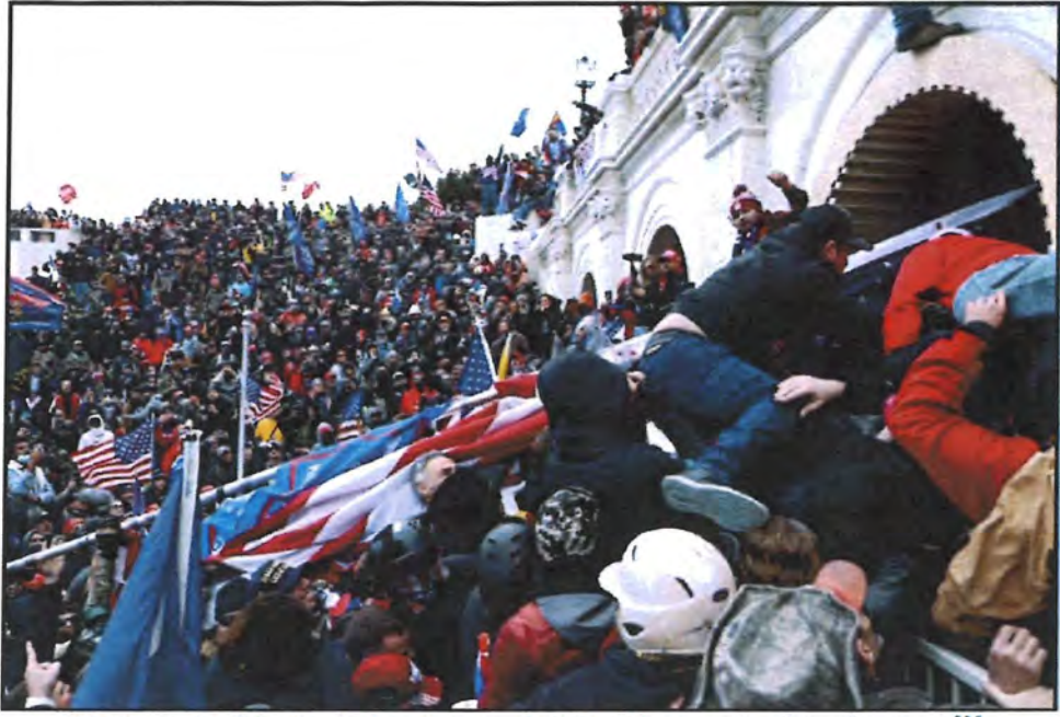
Photograph of the Capitol on January 6, 2021<sup>114</sup>