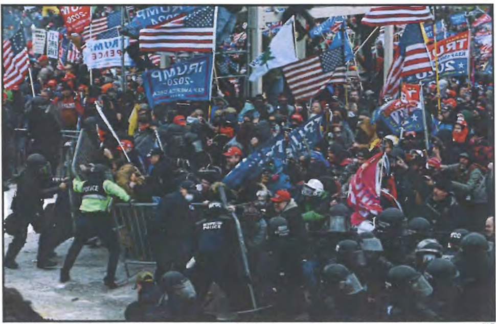
Photograph of the Capitol on January 6, 2021<sup>117</sup>