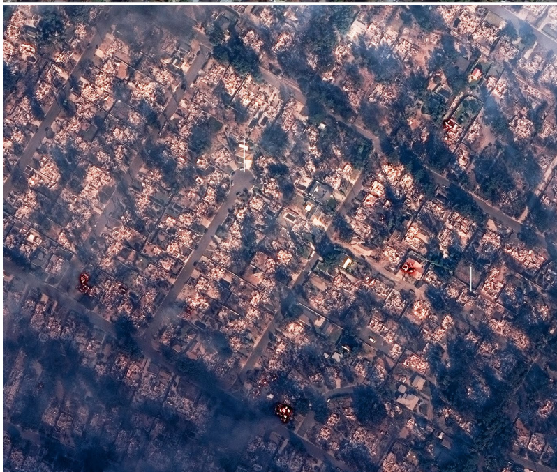
Example of Destruction Caused by Eaton Fire