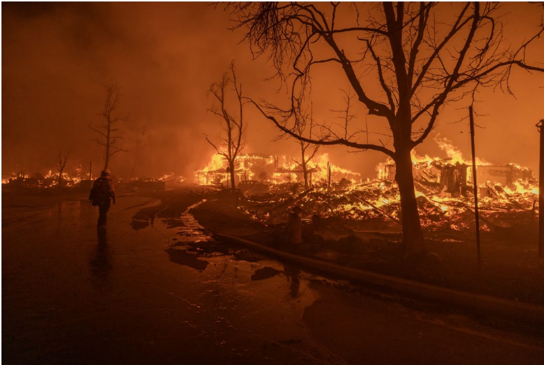
Flames of Eaton Fire

1. This Complaint arises from a wildfire caused by Defendant SOUTHERN CALIFORNIA EDISON COMPANY’s electric powerlines in Los Angeles County in California on January 7, 2025 — a wildfire now called the “Eaton Fire.”