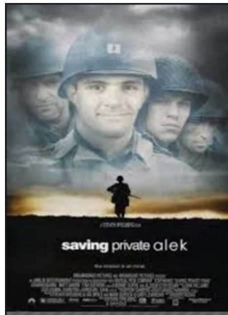
(U) Figure 1: Depiction of Alek Minassian as a soldier. Figure was archived and unavailable at the time of publication.