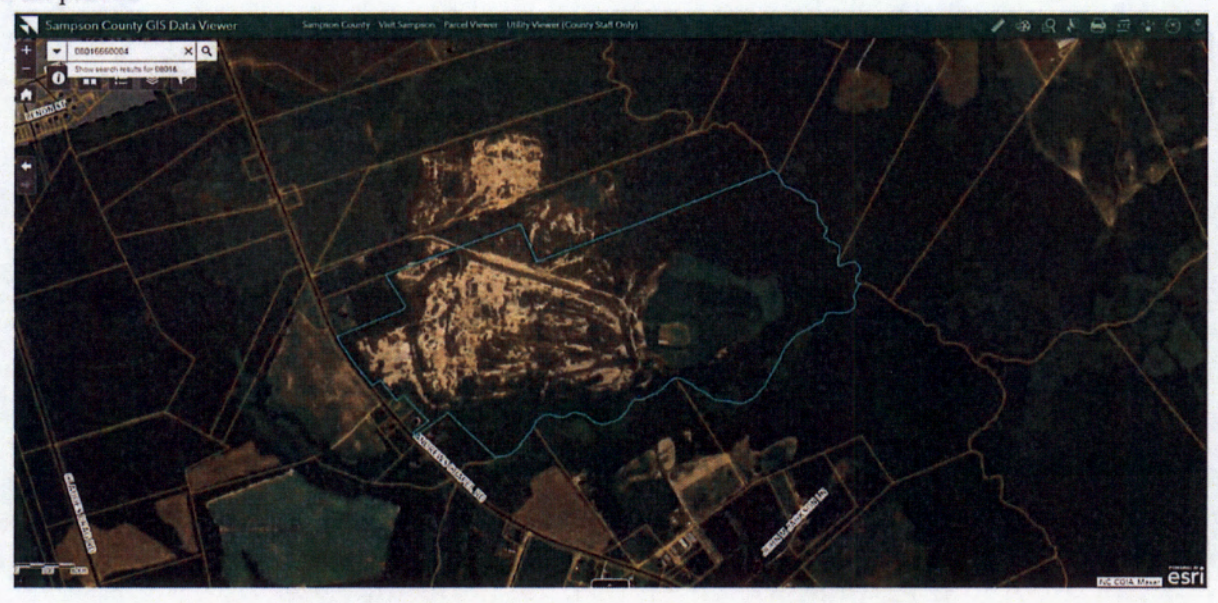
Approx 30 acre portion to be put into conservation in purple below: