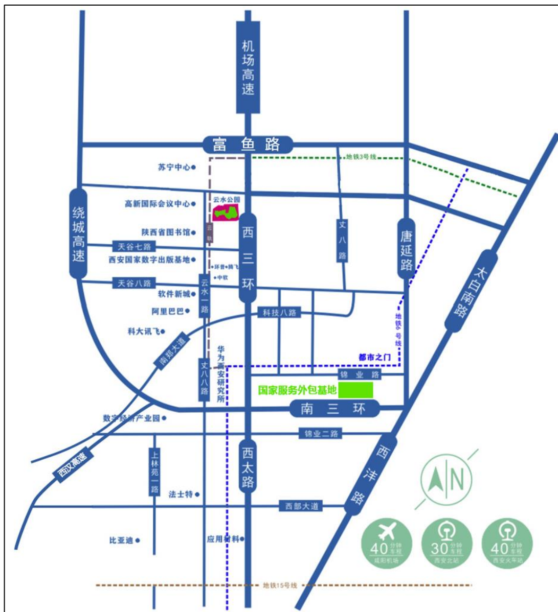
Figure 1. National Service Outsourcing Demonstration Base

126. In addition, there are a number of additional U.S. and international