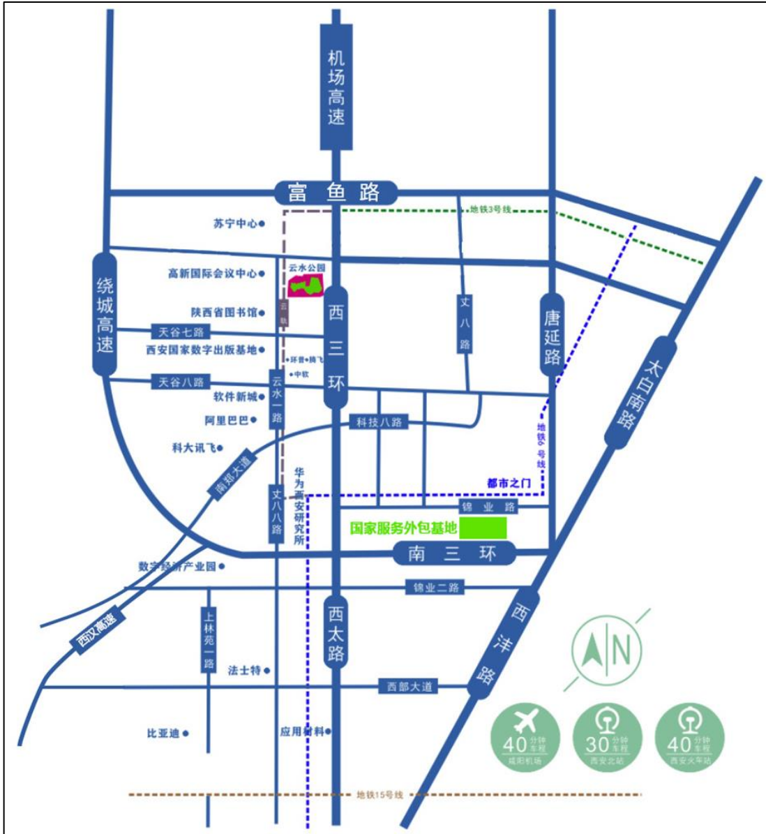
Figure 1. National Service Outsourcing Demonstration Base

126. In addition, there are a number of additional U.S. and international