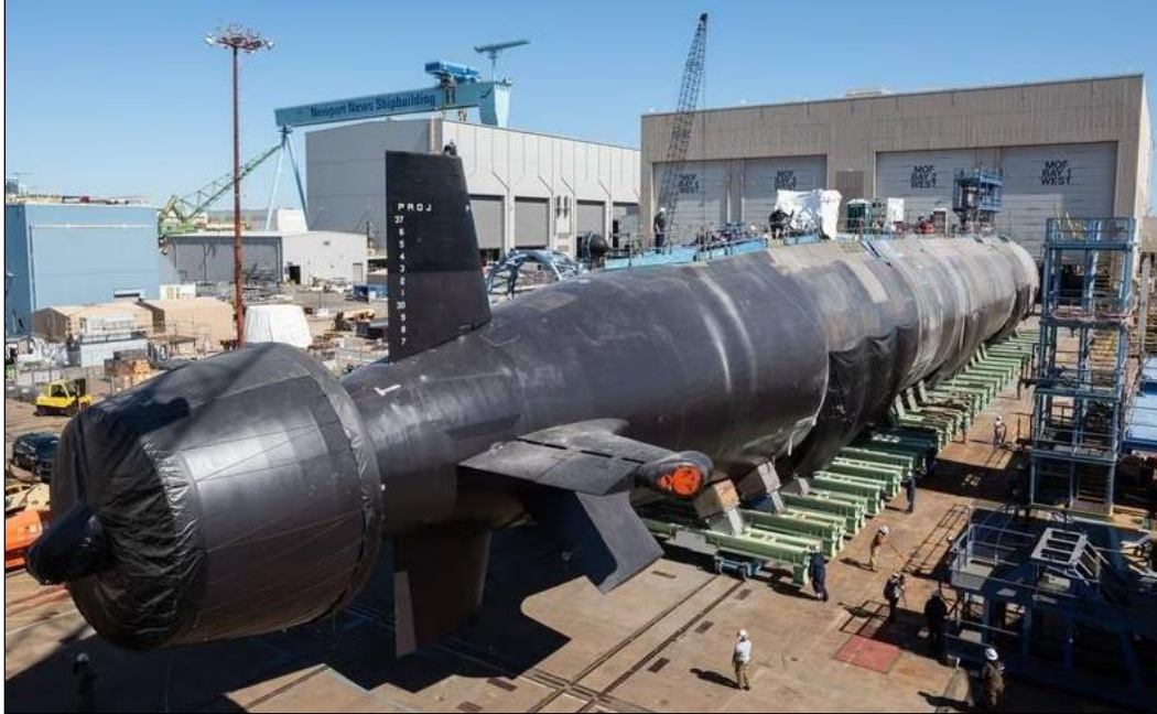
Figure 2. Virginia-Class Attack Submarine

Source: Cropped version of photograph accompanying Megan Eckstein, “Newport News Has Fully Staffed Attack Sub Line, After Years of Delays,” Defense News , February 9, 2023. The caption credits the photograph to Matt Hildreth/Hill and states that it shows USS Montana (SSN-794) under construction at Hill/NNS.