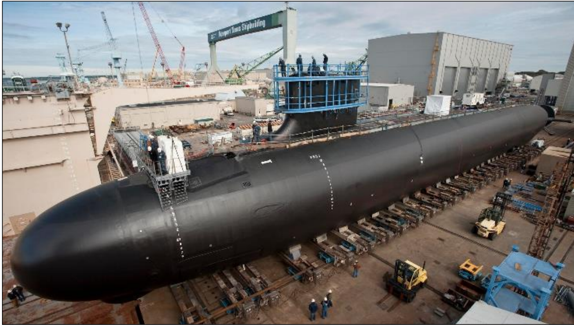
Figure 1. Virginia-Class Attack Submarine

Source: Cropped version of photograph accompanying Dan Ward, “Opinion: How Budget Pressure Prompted the Success of Virginia-Class Submarine Program,” USNI News , November 3, 2014. The caption credits the photograph to the U.S. Navy and states that it shows USS Minnesota (SSN-783) under construction in 2012.