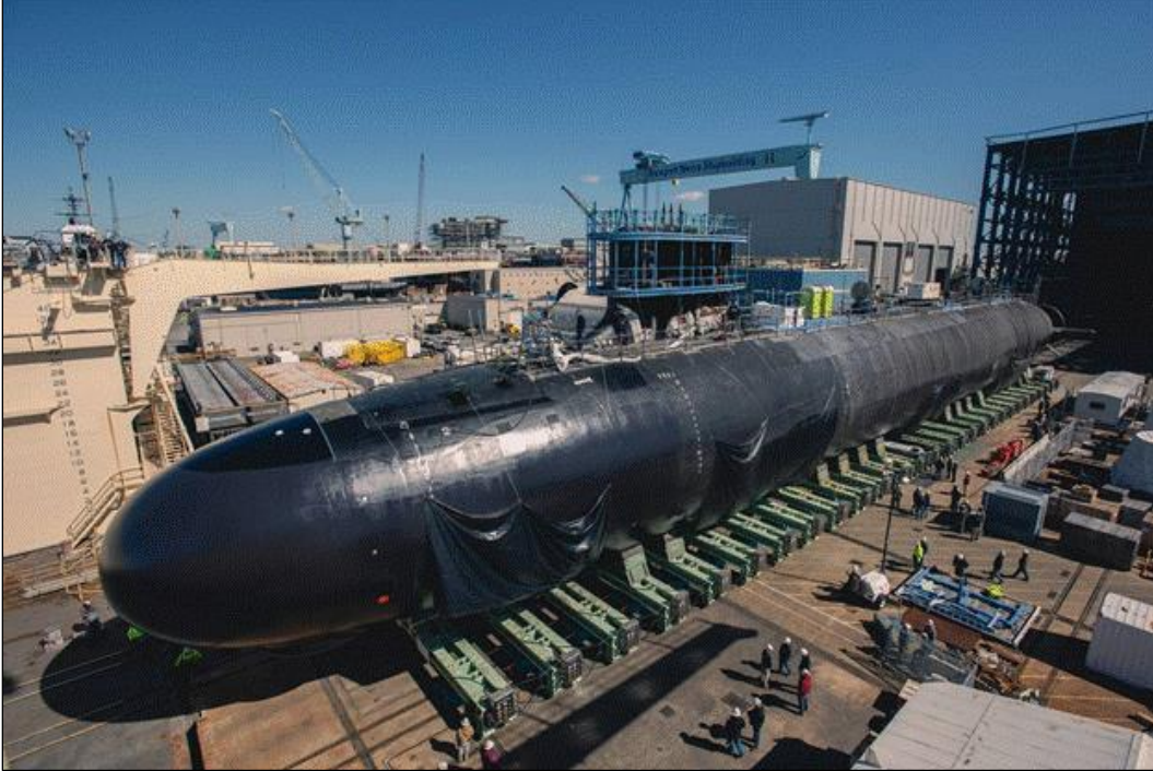
Figure 3. Virginia-Class Attack Submarine

Source: Photograph accompanying Megan Eckstein, “The US Navy Is Spending Billions to Stabilize Vendors. Will It Work?” USNI News , September 8, 2023. The caption credits the photograph to Ashley Cowan/HII and states that it shows the USS New Jersey (SSN-796) being moved at HII/NNS in April 2022.