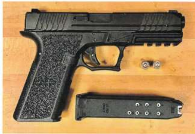
Pet. App. 232a, 238a; see id. at 236a-238a.