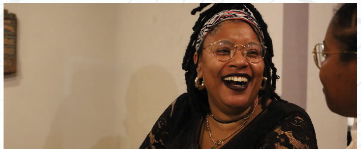
An NGPAF member enjoys a volunteer and membership community event in Atlanta.