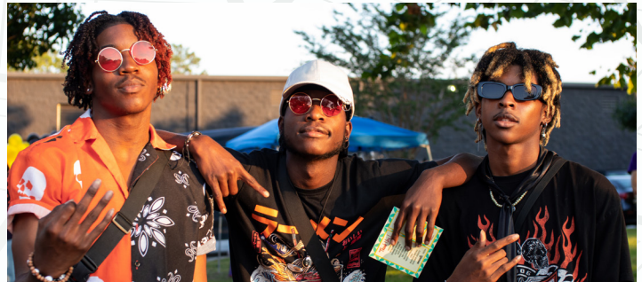
Georgia voters pulling up in community with NGPAF.