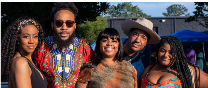
Georgia voters pulled up to NGPAF’s signature event, Collard Greens and Cornbread.