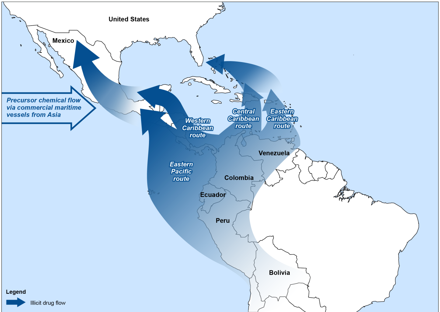
Figure 2: Maritime and Land Routes for Precursor Chemical and Illicit Drug Smuggling

Source: U.S. Coast Guard based on the Consolidated Counterdrug Database; Map Resources (Map). | GAO-24-107785