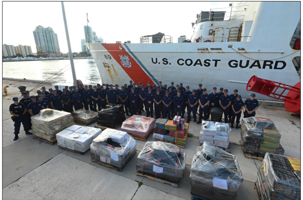
Figure 3: Joint Interagency Task Force-South Cocaine Seizure in the Caribbean Sea, September 2023

GAO-24-107785