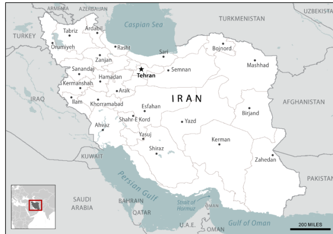
Figure I. Iran at a Glance

The Islamic Republic of Iran, the second-largest country in the Middle East by size (after Saudi Arabia) and population (after Egypt), has for decades played an assertive, and by many accounts destabilizing, role in the region and beyond. Iran's influence stems from its oil reserves (the world's fourth largest), its status as the world's most populous Shia Muslim country, and its active support for political and armed groups (including several U.S.-designated terrorist organizations) throughout the Middle East.