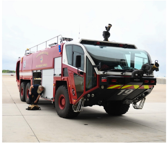
U.S. Navy aircraft rescue and firefighting vehicle.

GAO-24-107322