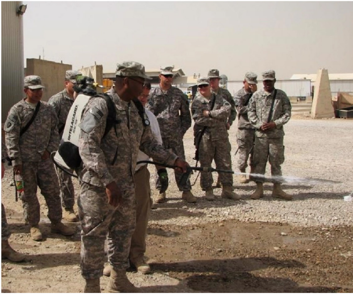
U.S. Army soldier demonstrating use of a Macaw backpack.