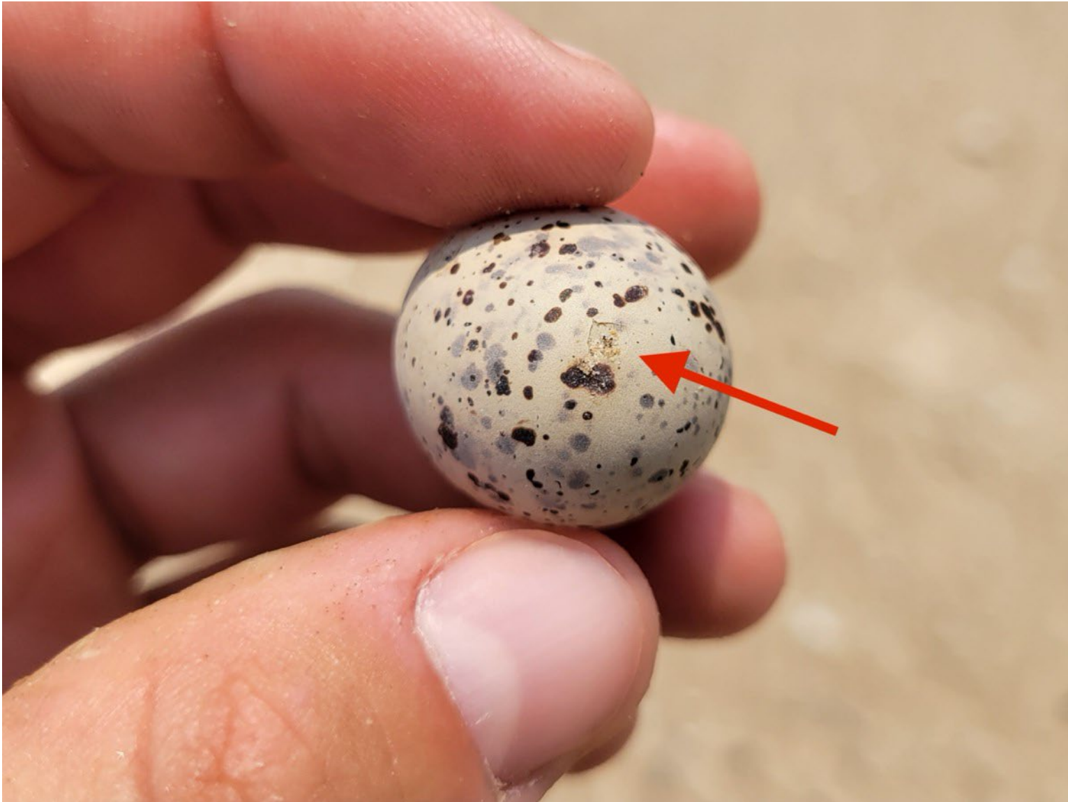
Figure 10. Lone egg from SNPL 5 with a small but significant depressed crack on June 6, 2024.