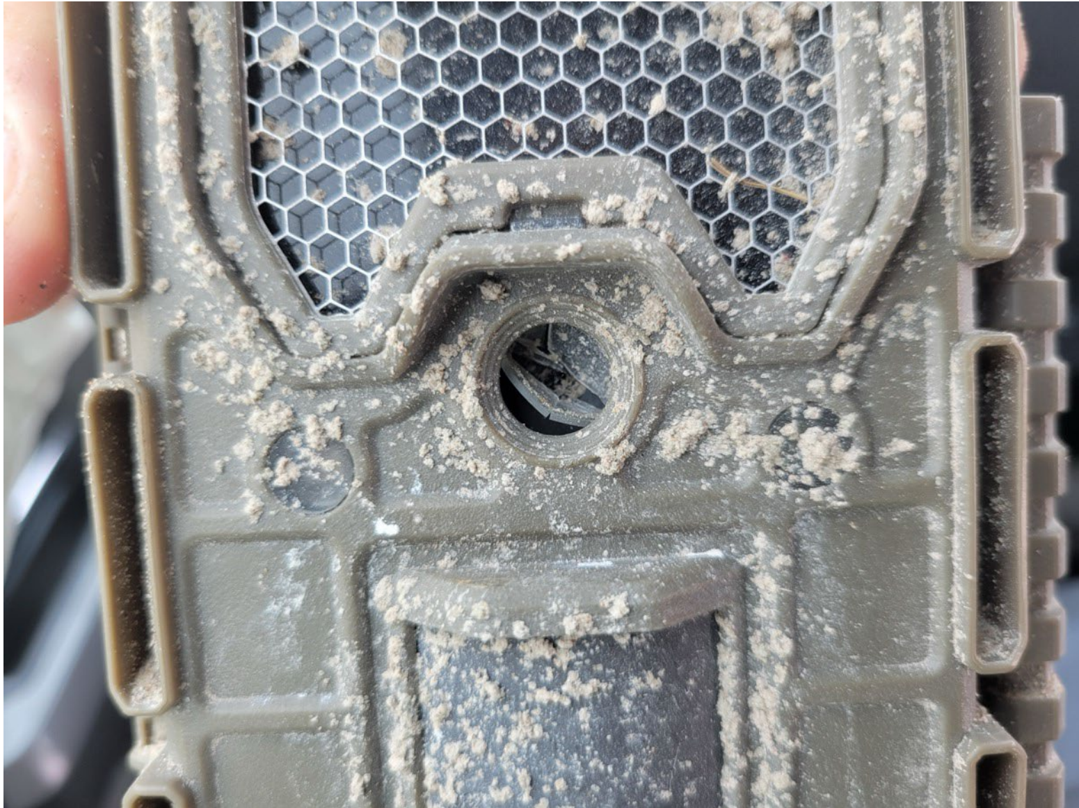
Figure 15. Game camera from WIPL 1 showing completely cracked camera lens after pebble was removed post-launch on June 6, 2024.