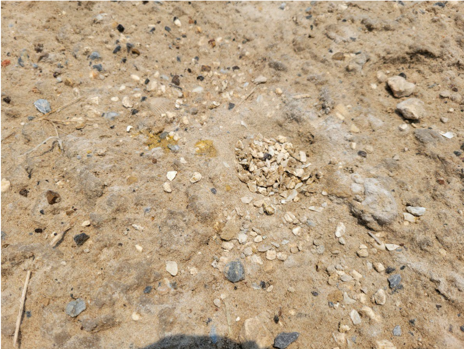
Figure 9. SNPL 4 with dried egg contents spilled in the nest cup and droplets moving away from it in a straight line on June 6, 2024.