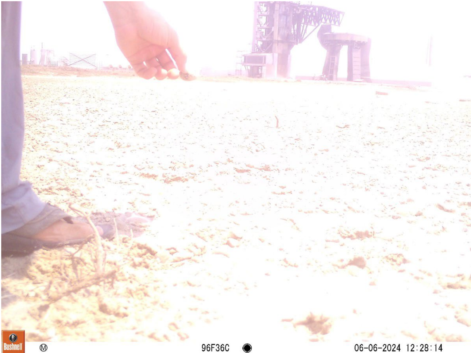
Figure 24. SNPL 2 game camera with CBBEP staff checking SNPL 2 nest post-launch on June 6, 2024, proving camera is still operational despite limited clarity.