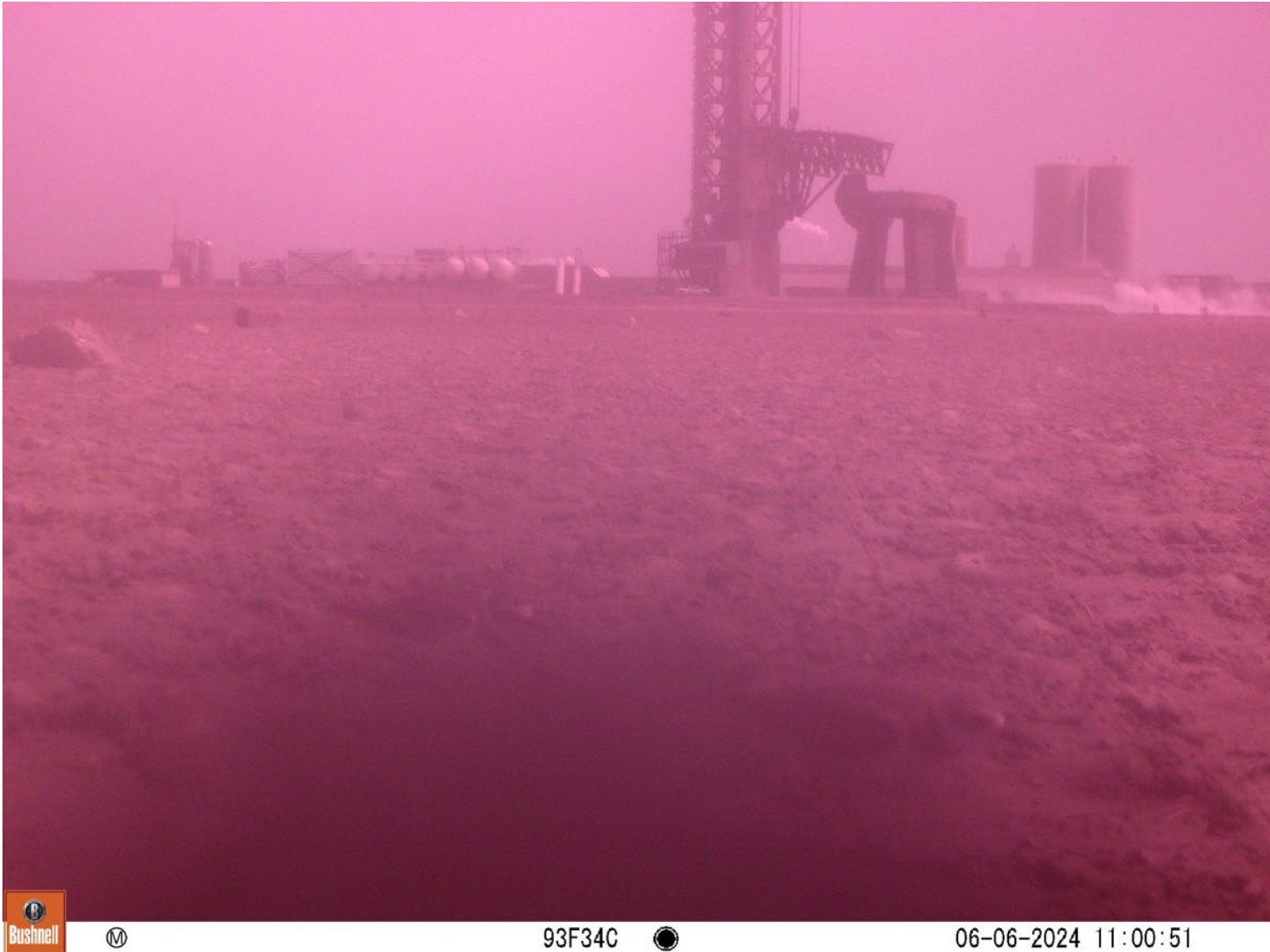
Figure 19. WIPL 1 game camera showing both WIPL adults in attendance but nest cup not quite visible due to pebble lodged in camera lens and overall pinkish hue post-launch on June 6, 2024.