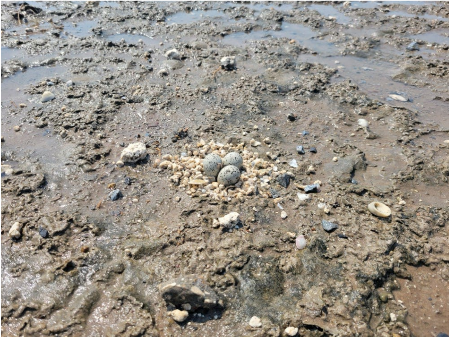
Figure 2. SNPL 1 nest intact and with 3 eggs on June 5, the day before the rocket test launch.