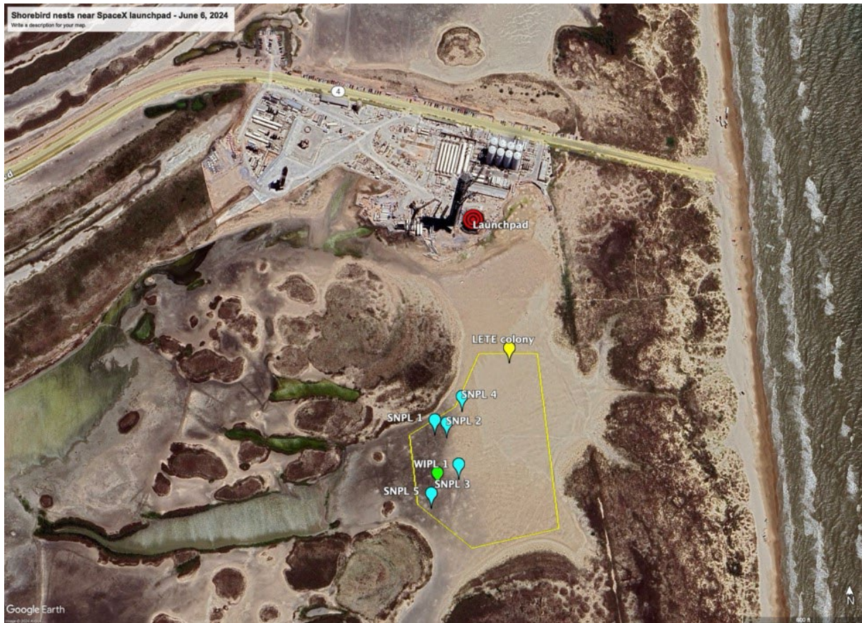
Figure 1. Map of the South Launch subsite at Boca Chica showing the locations of active plover nests and a dispersed Least Tern colony on June 5, 2024 in relation to the rocket launchpad.