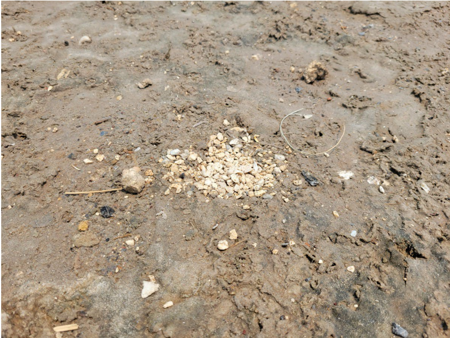
Figure 3. SNPL 1 nest with 0 eggs and no signs of predator tracks despite moist ground that would be highly impressionable by any predators on June 6, 2024.