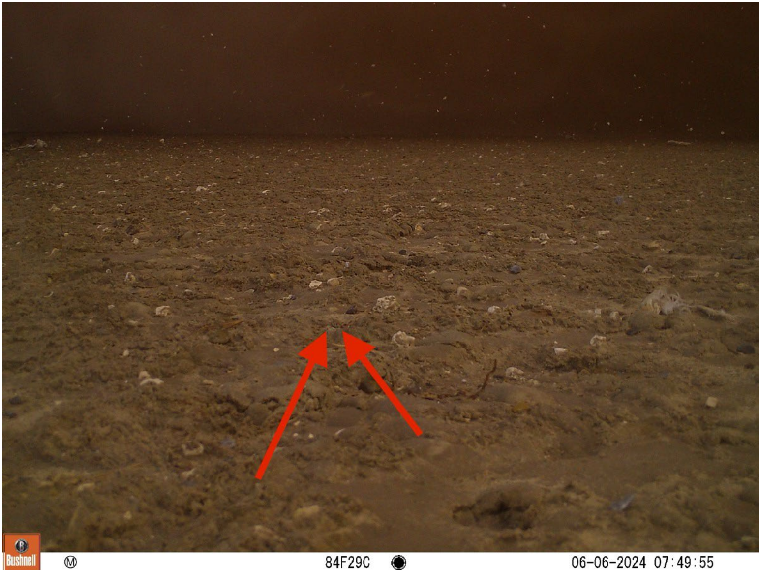
Figure 22. SNPL 2 game camera showing dust cloud and small pale-colored debris moving toward nest and game camera at a high rate of speed, with nest cup and at least two eggs possibly visible as referenced by red arrows on June 6, 2024.