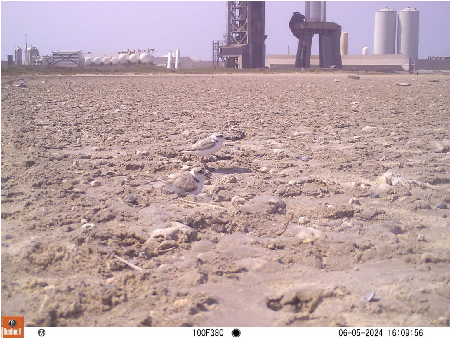
Figure 21. SNPL pair incubating SNPL 2 shortly after the game camera was set up pre-launch on June 5, 2024.