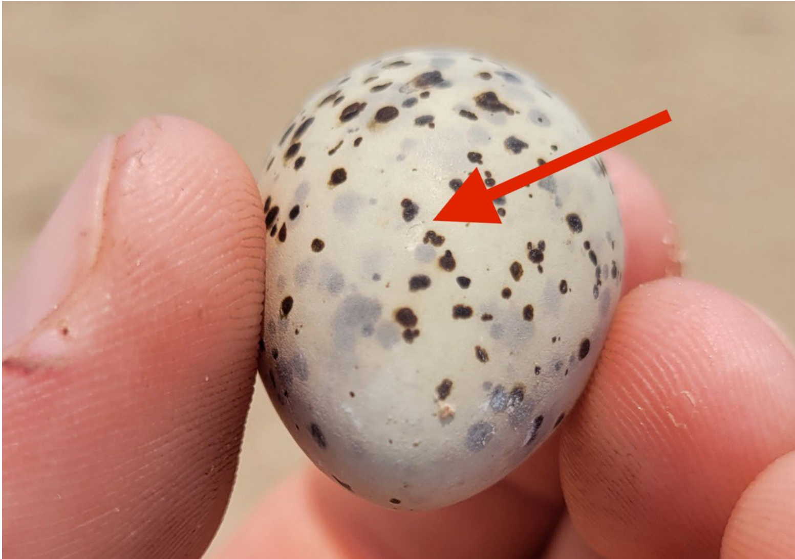
Figure 11. Small but noticeable crack on egg from LETE 2 on June 6, 2024.