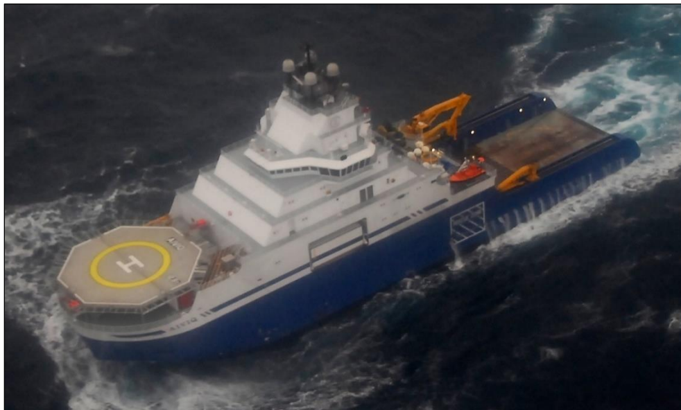
Figure A-8. Commercial Ship Aiviq