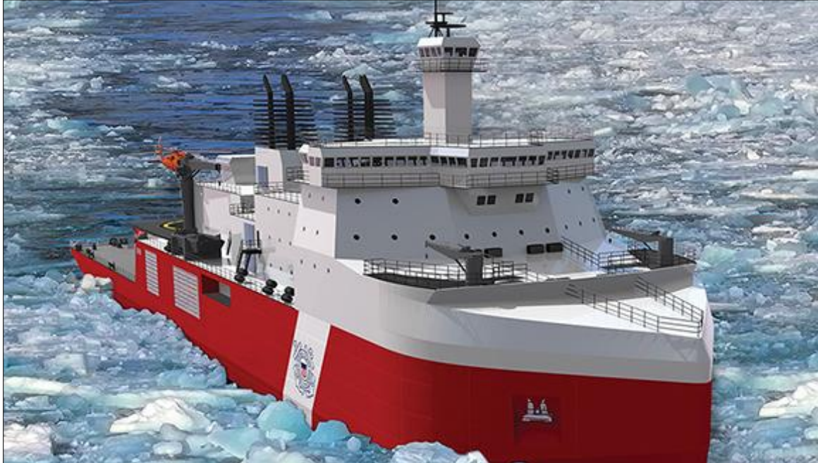
Figure 5. Rendering of Halter Marine Design for PSC