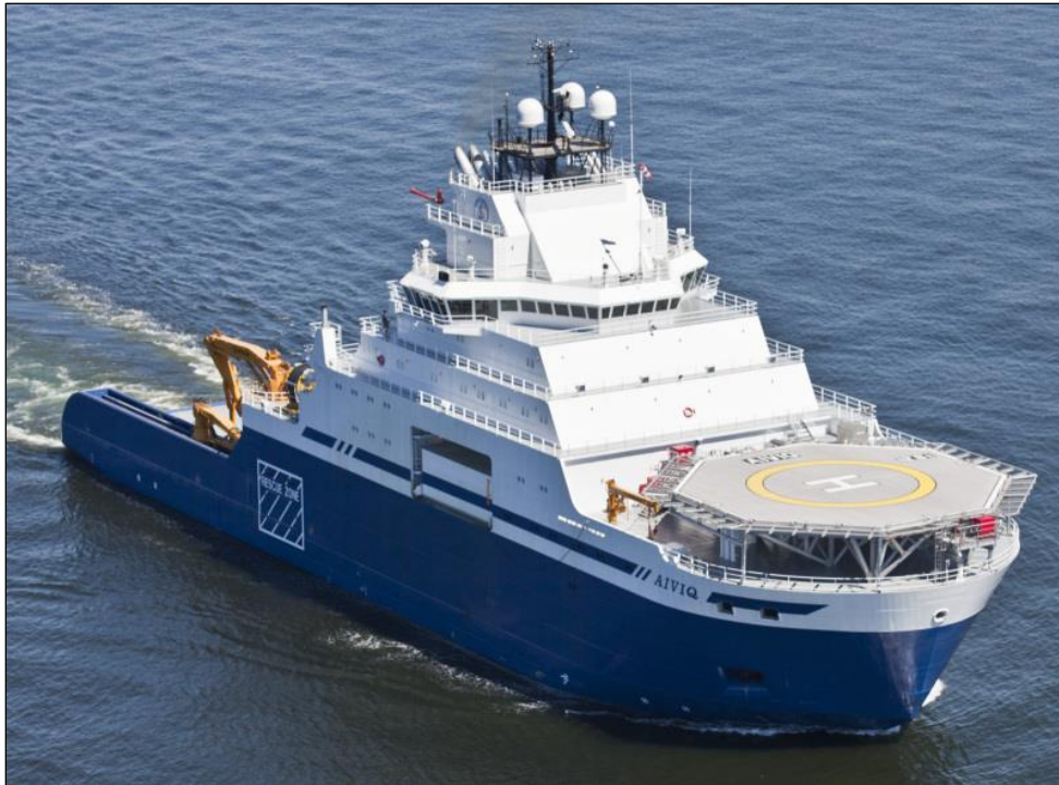
Figure A-7. Commercial Ship Aiviq