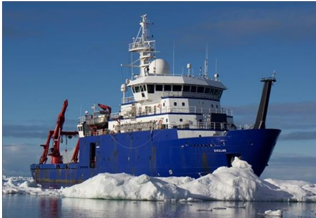
Figure A-6. Sikuliaq