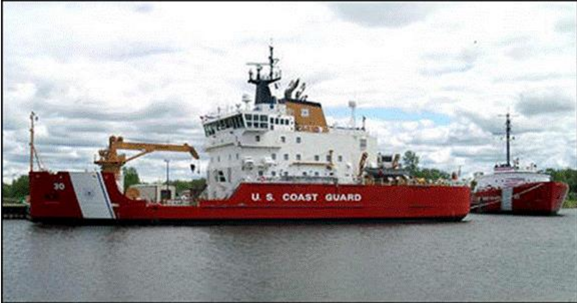
Figure 7. Great Lakes Icebreaker Mackinaw