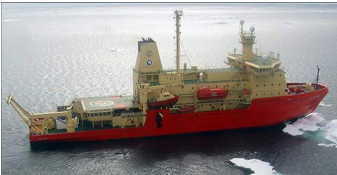
Figure A-4. Nathaniel B. Palmer

Source: Photograph accompanying Peter Rejcek, “System Study, LARISSA Takes Unique Approach for Research on Ice Shelf Ecosystem,” Antarctic Sun (U.S. Antarctic Program), September 18, 2009. A caption to the photograph states “Photo Courtesy: Adam Jenkins.”