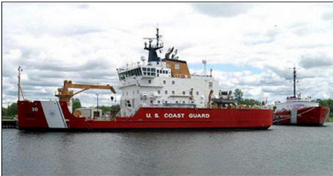
Figure C-1. Great Lakes Icebreaker Mackinaw