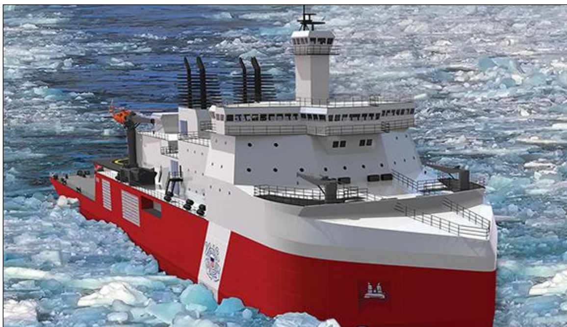
Figure 5. Rendering of Halter Marine Design for PSC