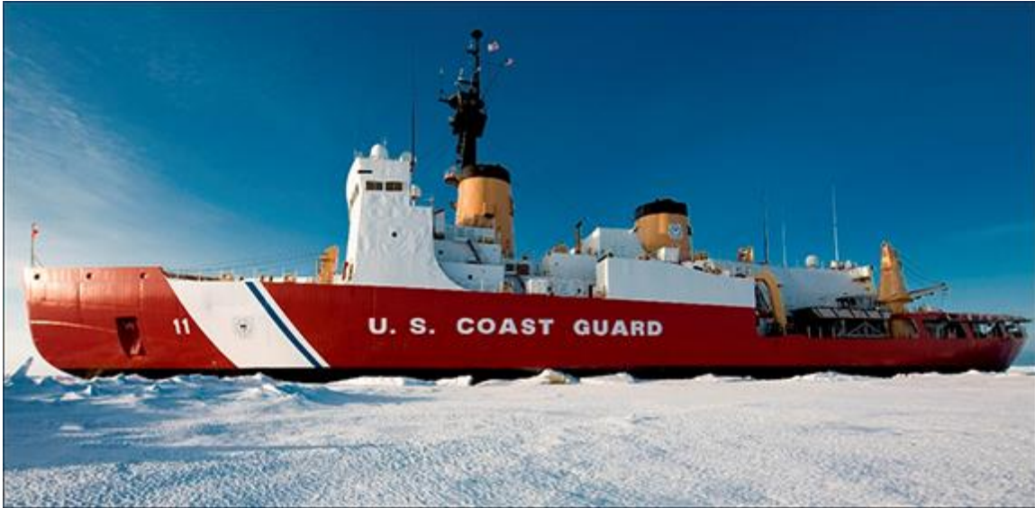
Figure A-2. Polar Sea