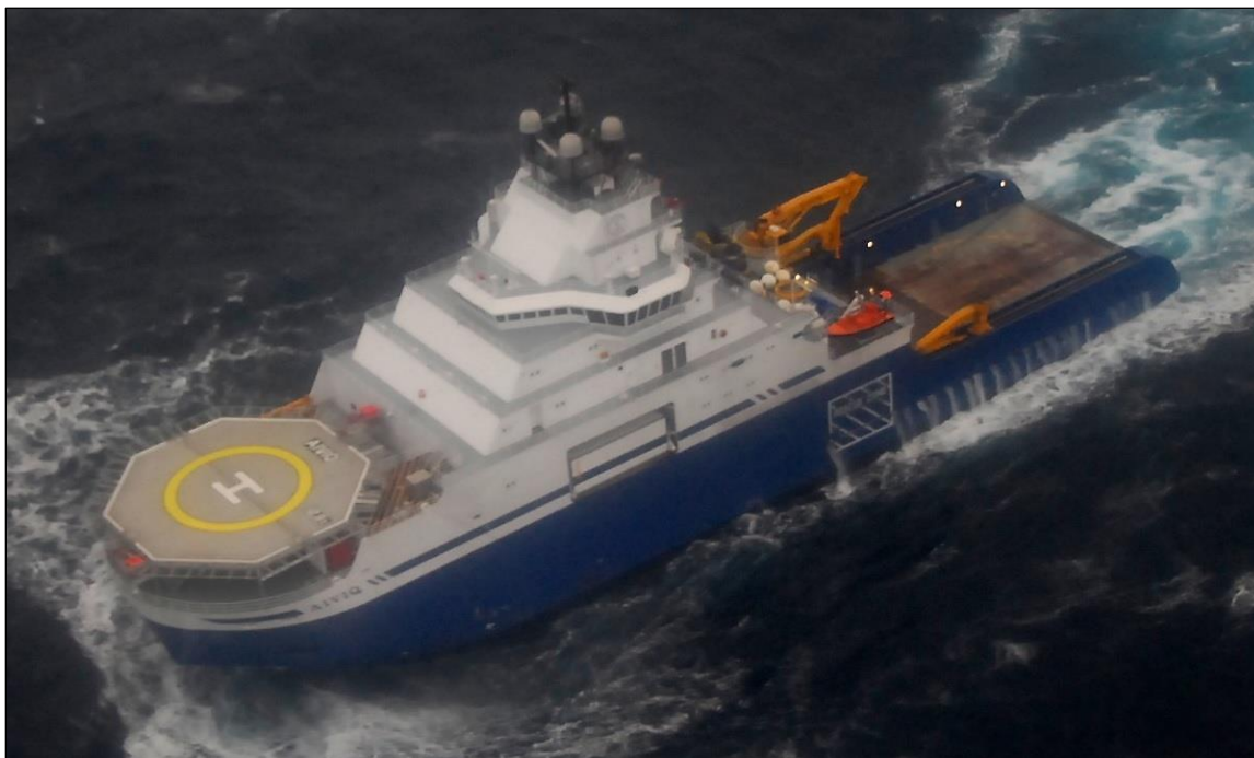
Figure A-8. Commercial Ship Aiviq