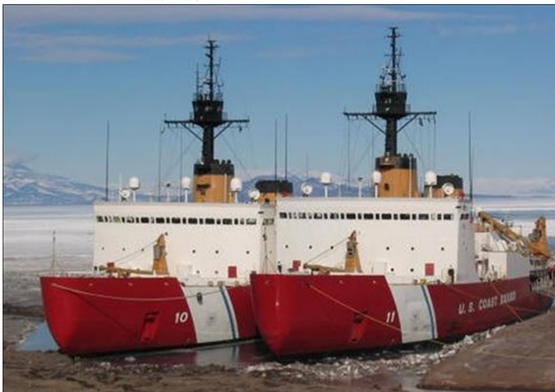
Figure A-1. Polar Star and Polar Sea (Side by side in McMurdo Sound, Antarctica)

Source: Coast Guard photograph that was accessed on April 21, 2011, at http://www.uscg.mil/pacarea/cgcpolarsea/history.asp (link no longer active). The photograph accompanies Kyung M. Song, “Senate Passes Cantwell Measure to Postpone Scrapping of Polar Sea Icebreaker,” Seattle Times , September 22, 2012, posted at http://blogs.seattletimes.com/politicsnorthwest/2012/09/22/senate-passes-cantwell-measure-to-postpone-scrapping-of-polar-sea-icebreaker/ .