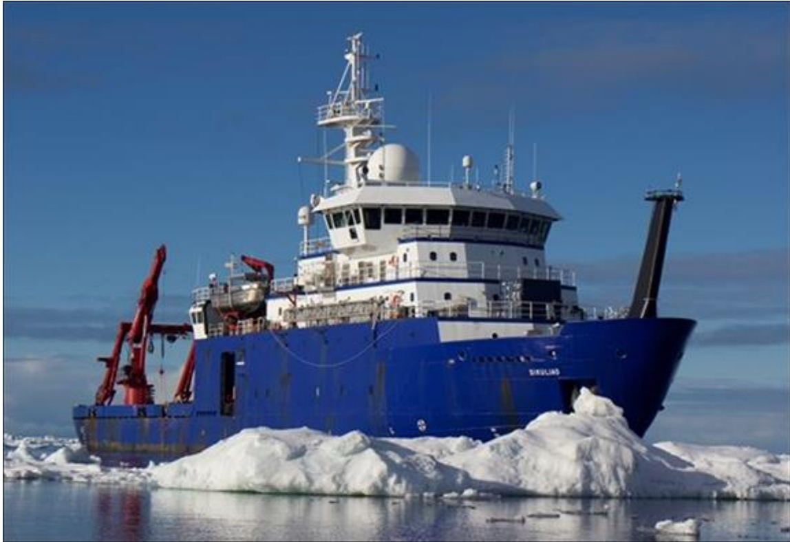
Figure A-6. Sikuliaq