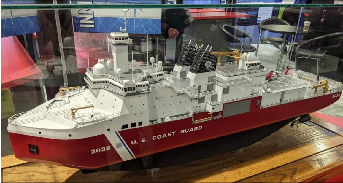
Figure 2. Model of Halter Marine Design for PSC (Photograph of model displayed at 2021 trade show)