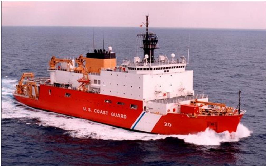
Figure A-3. Healy