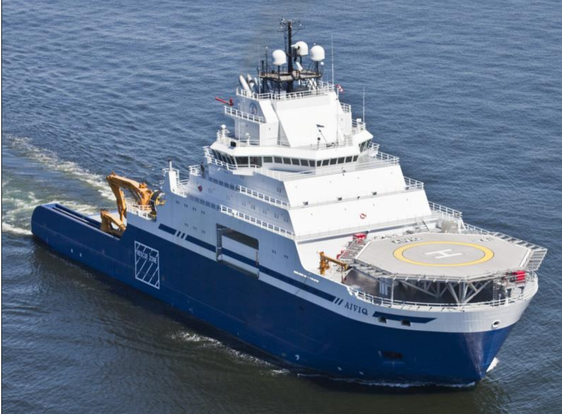
Figure A-7. Commercial Ship Aiviq