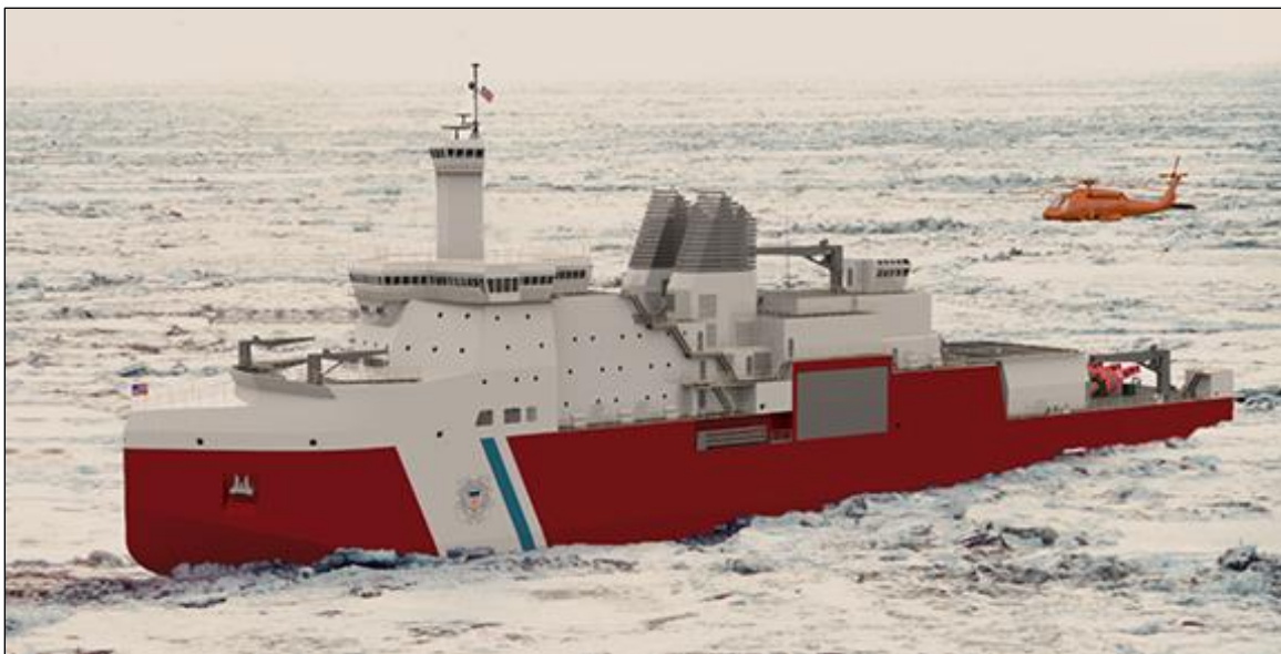
Figure 4. Rendering of Halter Marine Design for PSC

Source: Technology Associates, Inc. (cropped version of rendering posted at http://www.navalarchitects.us/pictures.html , accessed June 10, 2020). A similar image was included in Halter Marine press release, “VT Halter Marine Awarded the USCG Polar Security Cutter,” May 7, 2019, accessed May 8, 2019, at http://www.vthm.com/public/files/20190507.pdf .