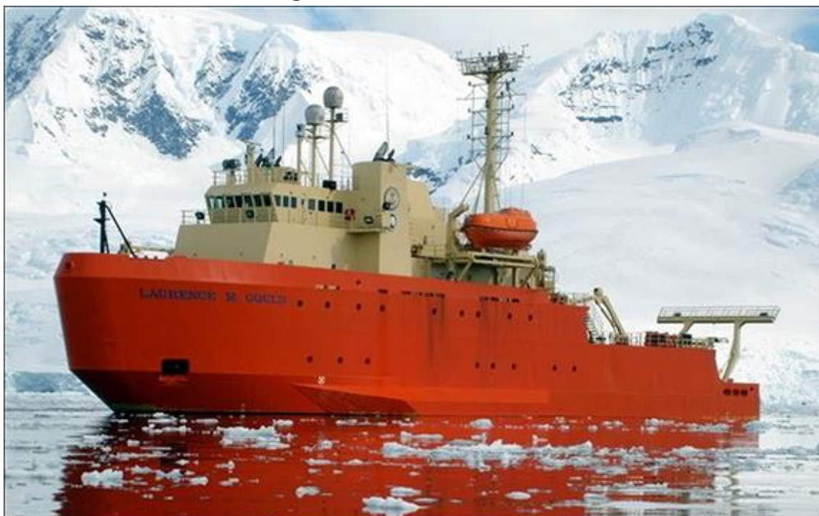
Figure A-5. Laurence M. Gould