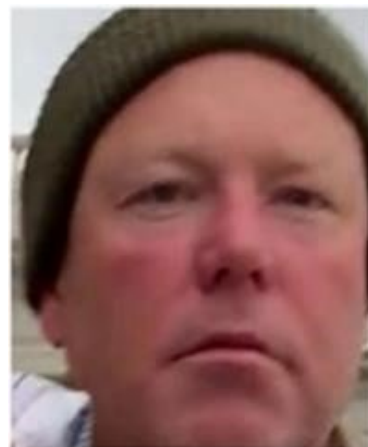
Photograph #466 – AFO C

Additionally, open-source websites referred to AFO #466 as #UnderHelmetSprayer and released the following poster, which included images of AFO #466: