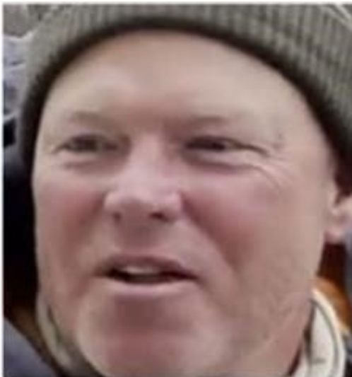
Photograph #466 – AFO D