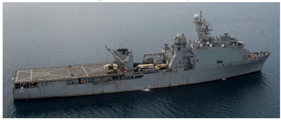
Figure 1. LSD-41/49 Class Ship

planning a 36-ship amphibious force that included 12 LSD-41/49 class ships. LSD-41/49 class ships have an expected service life of 40 years. The Navy began retiring LSD-41/49 class ships in 2021.