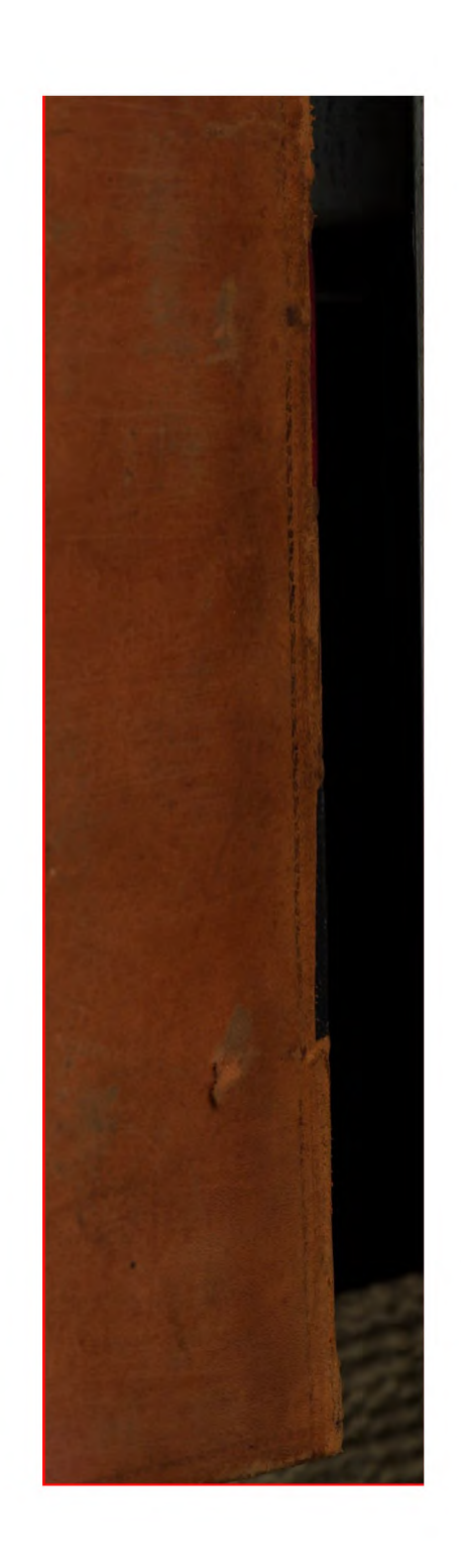
Digitized by Google