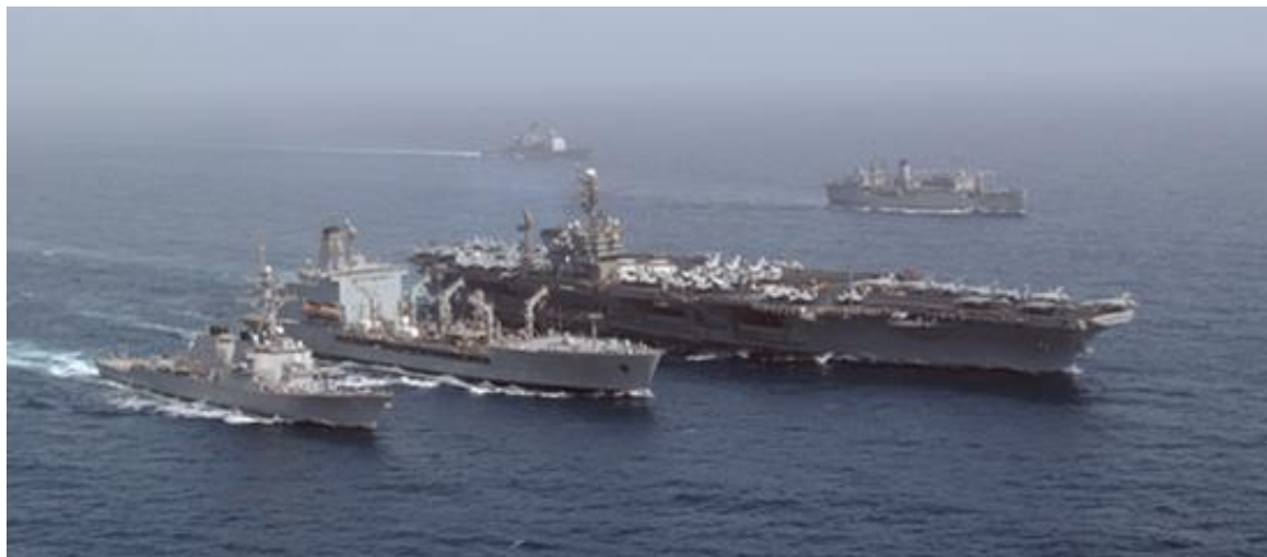
Figure 3. Fleet Oiler Conducting an UNREP

The Navy states that the photo is dated June 19, 2002, and shows the oiler Walter S. Diehl (TAO-193), at center,