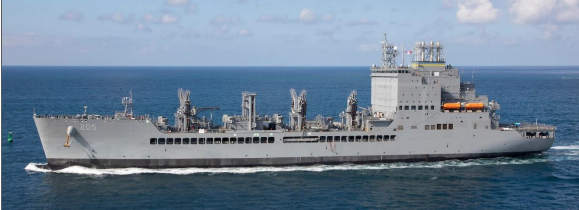
Figure 6. John Lewis (TAO-205)

Source: Cropped version of photograph accompanying Team Ships Public Affairs, “USNS John Lewis Conducts Builder’s Trials,” Naval Sea Systems Command, February 7, 2022.