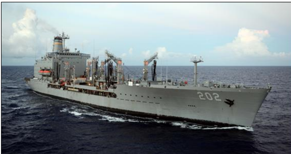
Figure 4. Kaiser (TAO-I 87) Class Fleet Oiler

(The oilers shown in Figure 1 , Figure 2 , and Figure 3 are also Kaiser-class class oilers.)