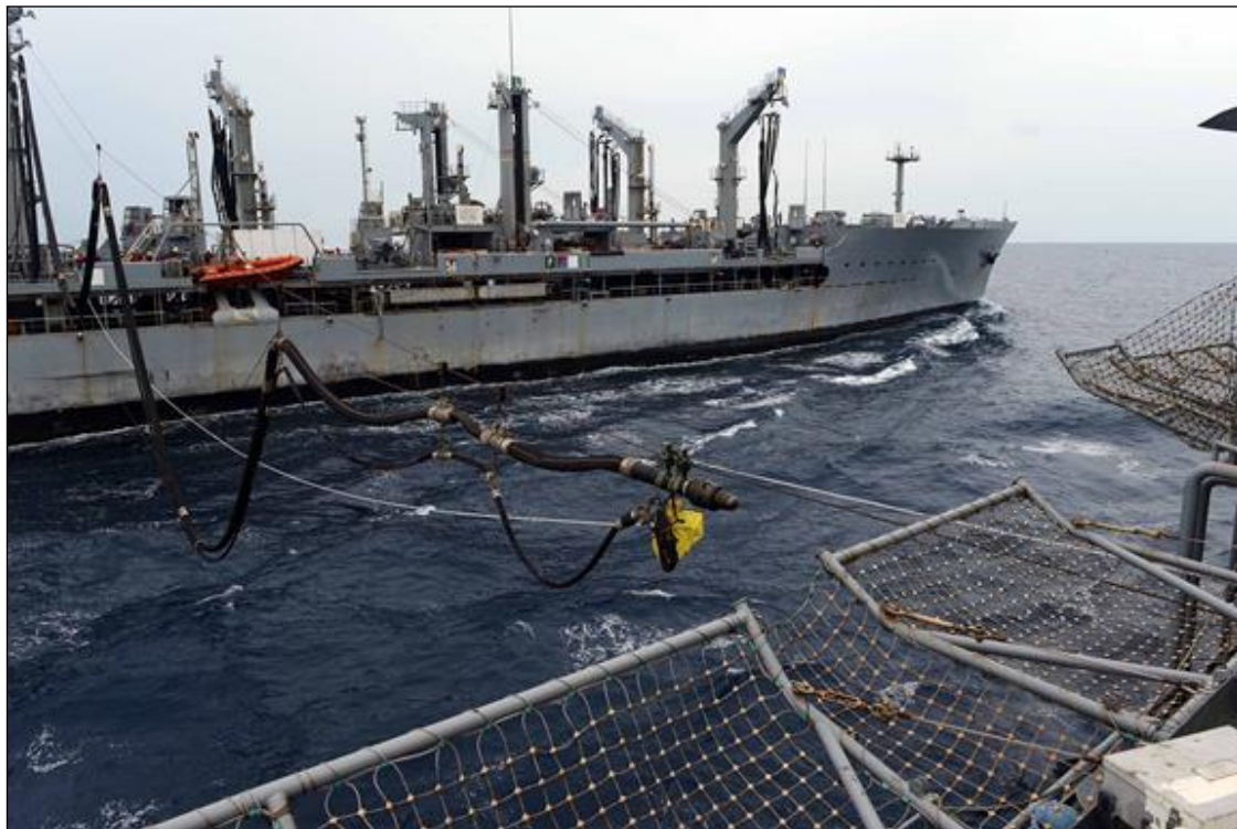
Figure 1. Fleet Oiler Conducting an UNREP

The Navy states that the photo is dated October 24, 2013, and shows the oiler Tippecanoe (TAO-199) extending its fuel probe to the Aegis cruiser USS Antietam (CG-54), a part of the George Washington (CVN-73) Carrier Strike Group, in the South China Sea.