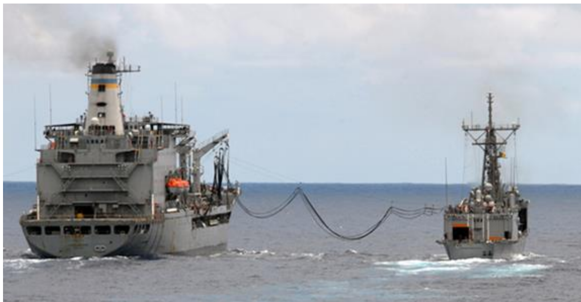
Figure 2. Fleet Oiler Conducting an UNREP

The Navy states that the photo is dated July 13, 2008, and shows the oiler Leroy Grumman (TAO-195) refueling the frigate Underwood (FFG-36) during an exercise with the Iwo Jima (LHD-7) Expeditionary Strike Group in the Atlantic Ocean.