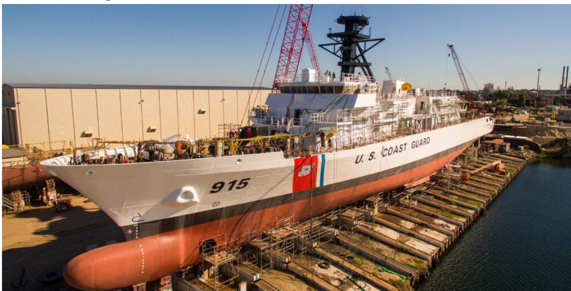
Figure 8. First Offshore Patrol Cutter Under Construction