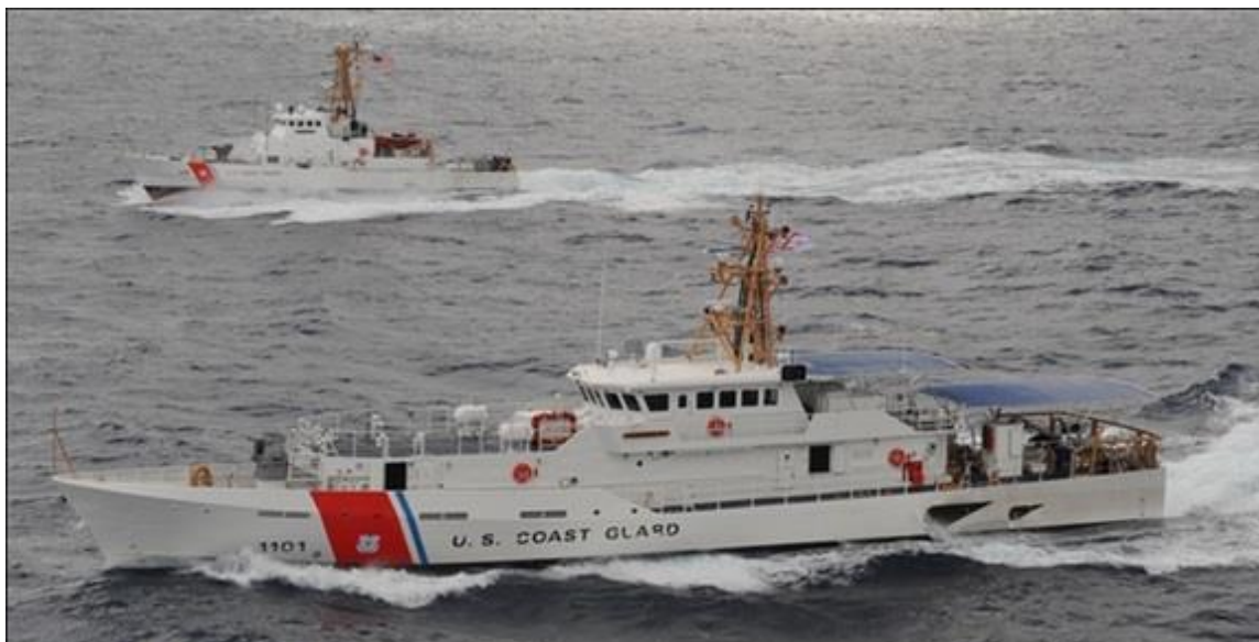
Figure 10. Fast Response Cutter With an older Island-class patrol boat behind