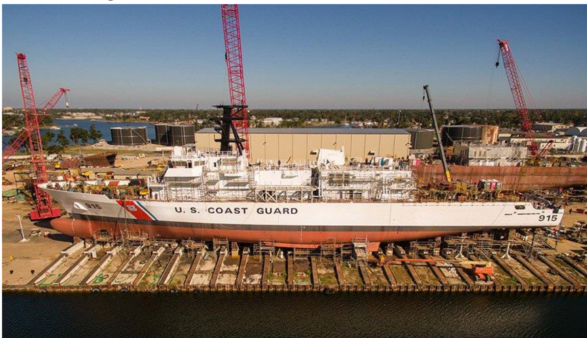
Figure 7. First Offshore Patrol Cutter Under Construction