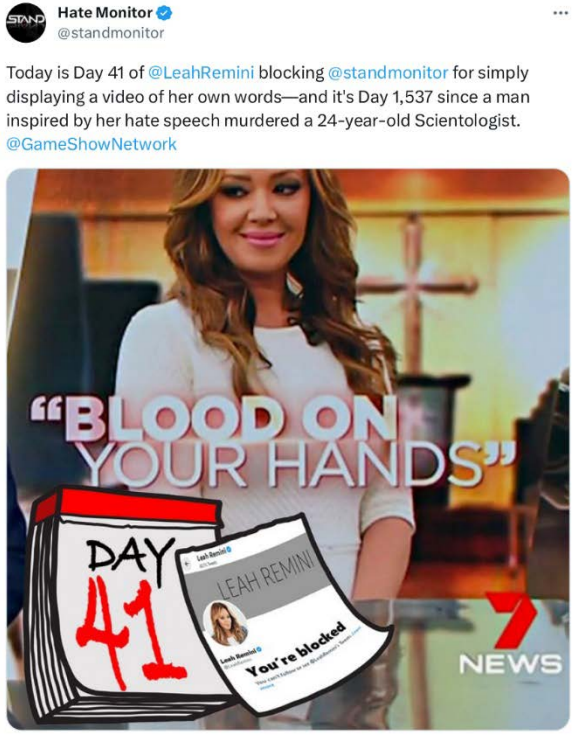
11:00 AM · Mar 19, 2023 · 1,285 Views 5 Retweets 21 Likes

1 2 3 4 5 6 7 8 9 10 11 12 13 14 15 16 17 18 19 20 21 22 23 24 25 26 27 28