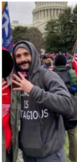
Image 2 – Zoomed-in image of Defendant 1’s Facebook post shown in Image 1, showing STAPLES, as identified by tipster

The tipster also provided a post from Defendant 1 in which STAPLES was tagged. The tipster identified STAPLES in a picture within the post, which showed Defendant 1 and STAPLES standing together with the U.S. Capitol in the background. A reproduction of this image that has been cropped to show STAPLES is provided below.