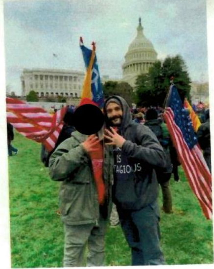
Image 5 – Copy of Photograph Posted to Defendant 1’s Facebook Page, Shown to STAPLES during December 2021 interview

STAPLES stated that he deleted his Facebook account shortly after leaving the Capitol.